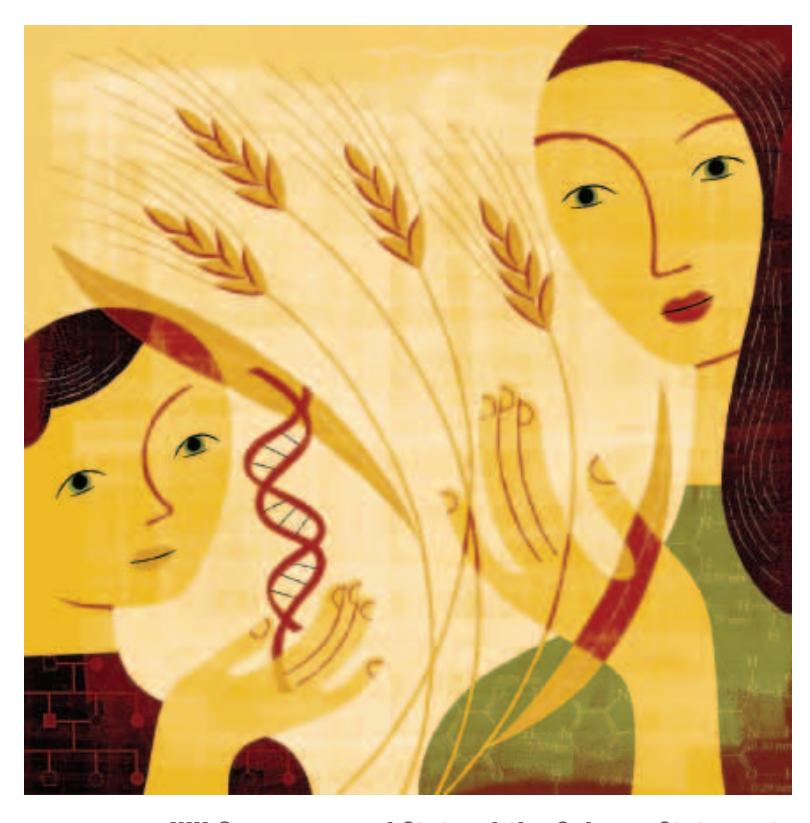
NIH Consensus and State-of-the-Science Statements