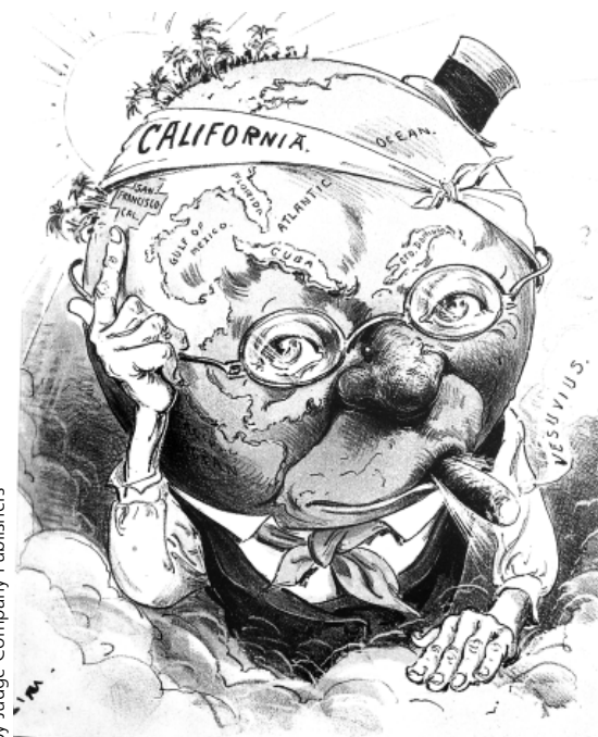
1906 by Judge Company Publishers

camps into small tent towns, where people quickly established the routines of everyday life; children formed playgroups, and dining halls and camp fires became the center of social gatherings. The camps on the Presidio were the first to dismantle, closing in mid-June. Most refugees moved out as the city rebuilt, while others were housed more permanently in small wooden Earthquake cottages. By 1908, these camps were disbanded as the cottages were moved onto the owners' private property, providing the opportunity for many to own their first homes. The crisis was over.