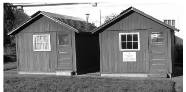
Refugee cottages on the Presidio today

The 250,000 left homeless after the earthquake established camps in parks, on military reservations, and amidst the ruins. The army helped organize these