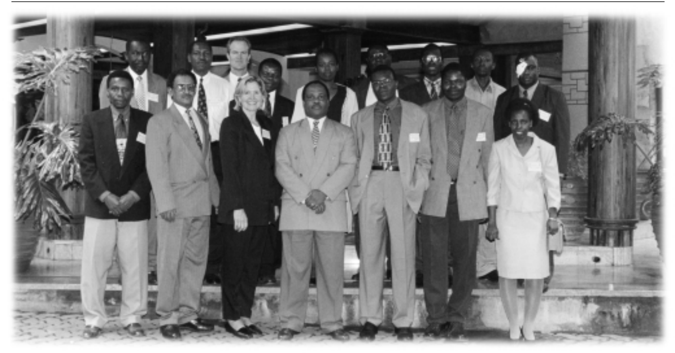
Newly certified instructors from Malawi, Tanzania, and Zimbabwe, with FHWA instructors.

HWA, through the Office of International Programs in collaboration with African countries, has established Technology Transfer (T<sup>2</sup>) centers in Malawi, South Africa, Tanzania, and Zimbabwe. The major function of the T<sup>2</sup> centers is to transfer transportation technology from various sources to meet local needs.