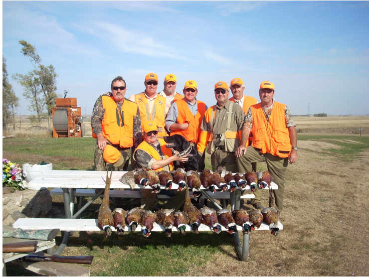
The iron curtain has returned!!