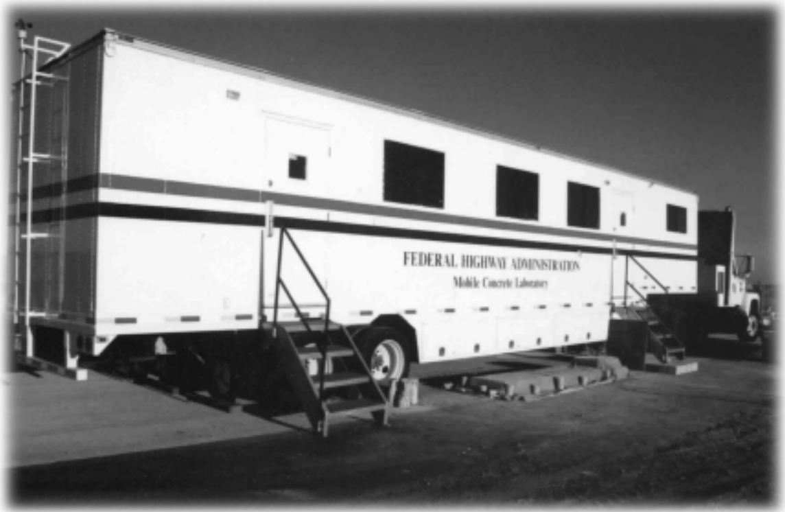
FHWA's Mobile Concrete Laboratory has been busy helping improve concrete quality in Indiana and Nebraska.

The fully equipped laboratory can be used to perform an extensive list of concrete tests, including such quality control tests as temperature, slump, air content, and unit weight measurements; elastic modulus; and strength