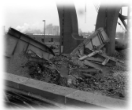
After demolition, the steel girders were extracted from the wreckage and sent to TFHRC for evaluation.

All of the damaged portions of the bridge containing those fractures arrived at TFHRC on January 25. The girders will undergo evaluation in a variety of ways; the materials are undergoing extensive testing to determine their strength, toughness, and chemical composition; they will also undergo a fracture mechanics evaluation, including the development of a detailed analytical model that will be used to assist in determining the cause of failure. In addition, the Nondestructive Evaluation Validation Center (NDEVC) will be evaluating the girder sections and