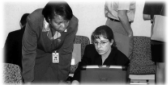
U.S. DOT librarians tap into the RIDER information network during a library-training workshop held at TFHRC in October 2000.