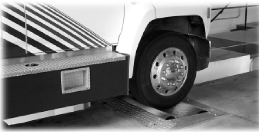
Researchers evaluated several types of PBBTs in the round robin study, including this in-ground roller dynamometer.

Gary Woodford (202) 366-2978 gary.woodford@fhwa.dot.gov