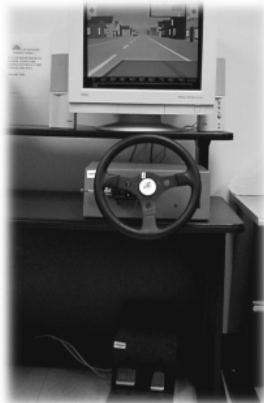
The new PC-based simulator makes it possible to develop interactive driving simulations at very little cost.