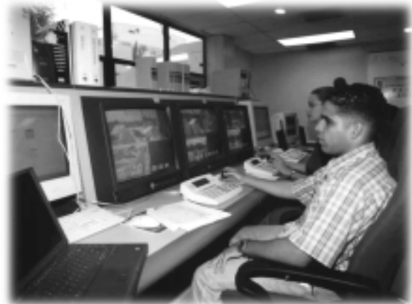
TMC was established at a fire station located near the port and was staffed by PRHTA traffic and operations personnel.

TMC provided continuous traffic monitoring and incident management before and during the regatta. From TMC, traffic signals were programmed according to traffic conditions; changeable message signs displayed appropriate messages regarding parking and route instructions; and the advisory radio provided traffic advice, event itinerary, and public transportation updates. During peak travel hours, reversible lanes were marked using innovative delineated devices made of PVC tubing and retroreflective sheathing. Incidents, disabled