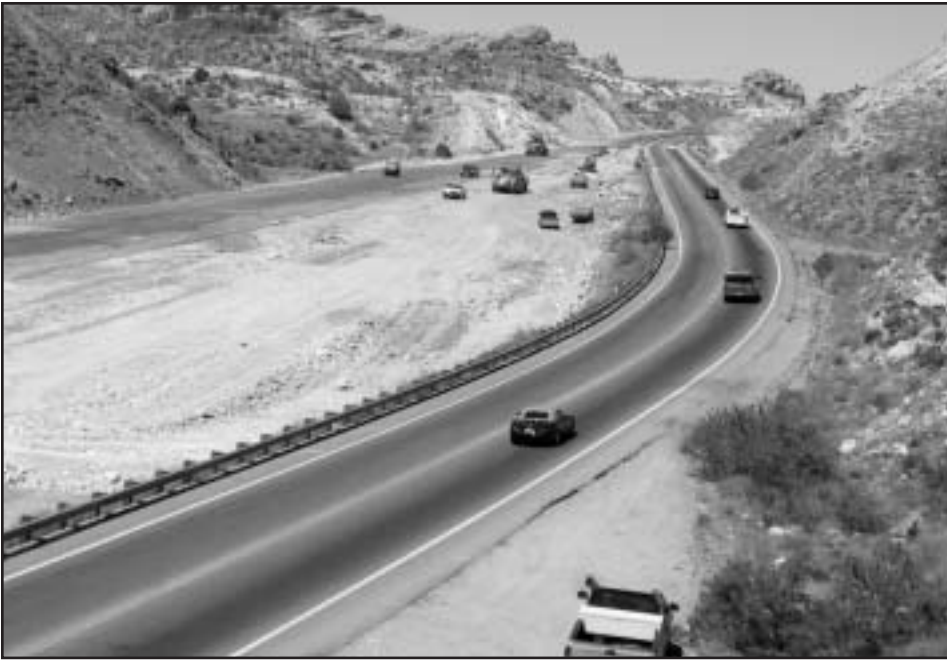
Figure 2 – Construction Along the Steep Grade on State Route 68

ADOT specified requirements for the use of a system to measure travel time through the work zone based in large part on technology demonstrations that key staff had viewed at the Rural Advanced Technology and Transportation Systems annual conference in Flagstaff, Arizona, in August 1999. ADOT had successfully used other incentive/disincentive programs in the past, such as lane rental and a quality workmanship incentive, and was interested in using similar techniques on this project. ADOT was concerned, however, that the contractor might plan for short frequent lane closures, thereby avoiding penalty under the lane rental incentive (which issued penalties for lane closures greater than five minutes in duration), but still imposing unnecessary delay on motorists. To address this concern, ADOT decided to supplement their planned incentive/disincentive programs with a travel time incentive strategy to encourage the contractor to keep traffic moving efficiently through the SR 68 work zone. The contractor selected a camera-based license plate matching system by Computer Recognition Systems to determine travel times through the work zone. The system included two monitoring stations, one at each end of the work zone, and a central processor. Cameras at the monitoring stations took pictures of vehicle license plates entering and leaving the work zone and the system used these images to determine vehicle travel times through the work zone.