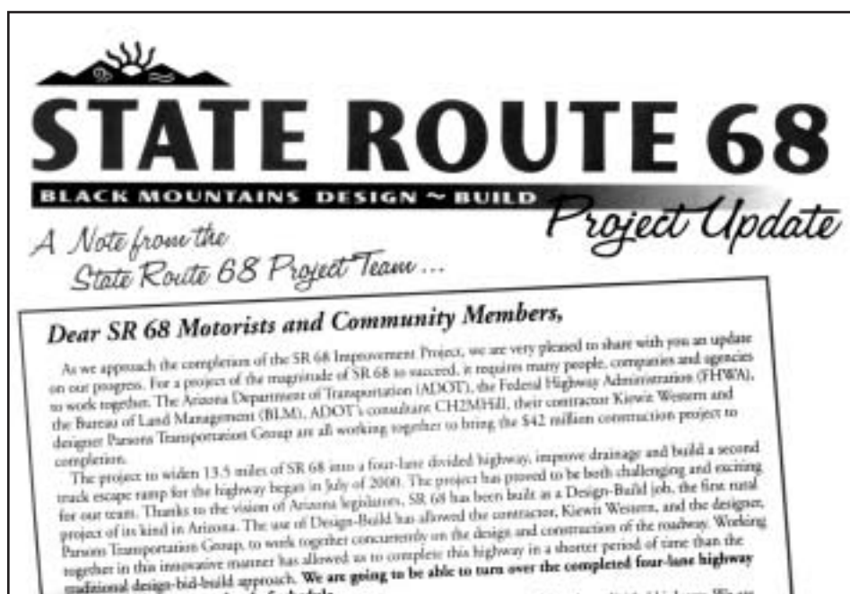
Figure 5 – Example of a Public Outreach Newsletter Distributed by ADOT