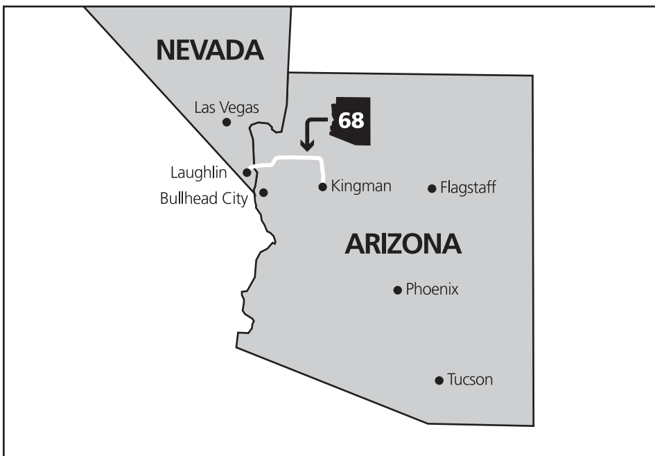
Figure 1 – Map of Project Location

SR 68 is a critical highway for the northwestern region of the state, primarily serving commuter traffic traveling between Kingman, Arizona, and the nearby cities of Laughlin, Nevada, and Bullhead City, Arizona (shown in Figure 1). Several characteristics of SR 68 presented ADOT with a challenge in completing the construction while promoting mobility and safety. SR 68 is a major commuter route for those employed by casinos and other entertainment venues in Laughlin. Due to the nature of the employment in Laughlin, SR 68 does not have typical a.m. and p.m. peak traffic periods, and generally has a steady volume of traffic from early morning to late evening.