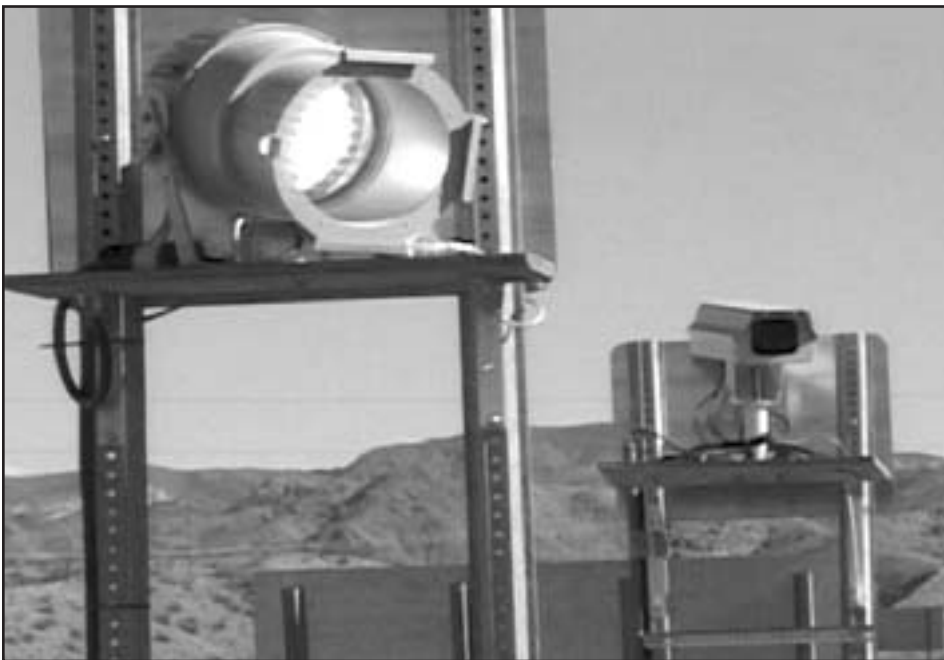
Figure 3 – Light and Camera Used to Collect License Plate Data