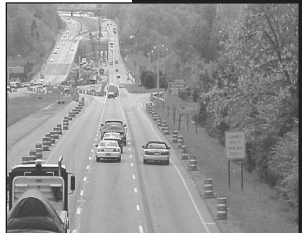
Figure 2 – District 8 in Ohio crossed one lane of traffic onto the opposite side with barrier separation to maintain three lanes in each direction and avoid lengthy delays for motorists during construction

—Bill Lozier, Deputy Director of Highway Management. Source: ODOT News Release