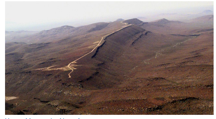
Yucca Mountain, Nevada

site selection and characterization continuing through to the recent preparation of the 8,600-page license application. Los Alamos scientists have characterized the mountain's subsurface geology, mineralogy, hydrology, and geochemistry to ensure that the natural geologic system can impede the movement of radionuclides should they ever be released from the engineered repository. Reliable risk assessment requires a vast amount of scientific data about the site—for example, its groundwater chemistry, the sorption characteristics of site minerals, and potential groundwater flow paths—as well as about the radionuclides that will be stored there. Los Alamos scientists have conducted countless laboratory and field tests over the years to amass these data, which have been combined to assess the performance of the complex physical and chemical system over many millennia. Because no experiment can come close to determining radionuclide migration over such a long period of time, Los Alamos has developed computer models that can look 10,000 years into the future to simulate the potential migration. The Los Alamos Finite Element Heat and Mass (FEHM) computer code is used by the project to predict water flow and the migration of radionuclides through the entire natural system.