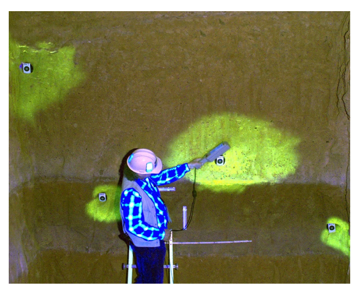
A Los Alamos scientist examines the migration of dye-laced water injected into unsaturated rock. These studies confirmed the conceptual model for water movement through the unsaturated tuffs of Yucca Mountain.

For 25 years, Los Alamos has made important contributions to the Yucca Mountain project, starting with