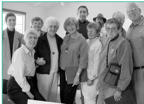
Rep. Lynn Woolsey listening to Seniors' concerns over Medicare legislation in Sonoma County on one of her many meetings with the community.

Among the reforms is a new prescription drug discount card. Although they've been billed as the cure for rising drug prices, in most cases the cards don't even keep up with rapidly increasing costs. It is a confusing system that doesn't serve consumers, who sign up for a 12-month commitment, while the discount