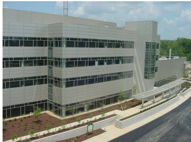
Research Center at Oak Ridge National Laboratory