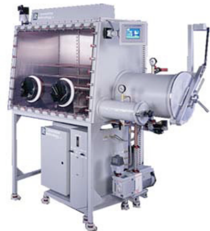
Glovebox Containment System