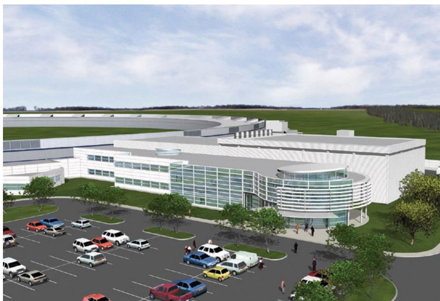
Research Center at Argonne National Laboratory

Medical surveillance expectations are not consistently understood and implemented. The implementation of baseline medical evaluation requirements and the identification of workers classified as needing baseline evaluations vary widely across the sites reviewed and often has not been consistent with the recommendations in the NSRC Approach Document. Some sites have not determined who should be classified as a “nanomaterial worker,” or what information should be collected and utilized to determine the absence of any unusual health effects. Some sites conduct baseline medical evaluations for all identified nanomaterial workers, while others restrict medical evaluations to one type of nanomaterial workers (i.e., those working with carbon nanotubes). Some sites consider the baseline evaluations to be voluntary. One site has chosen to defer any decisions specific to medical surveillance for nanomaterial workers until DOE provides further direction. As discussed elsewhere, support organization workers are not always considered for inclusion as nanomaterial