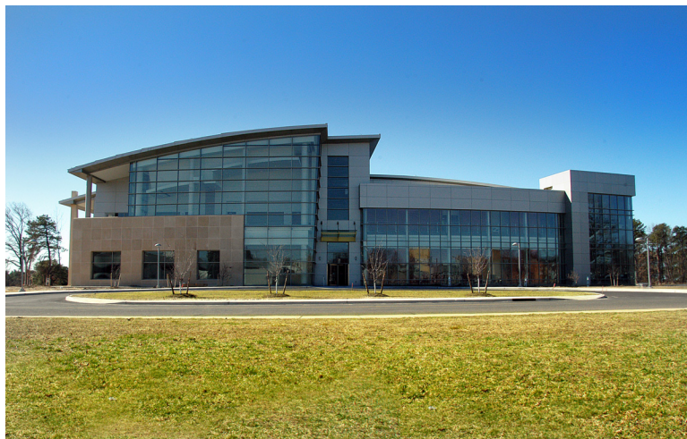
Research Center at Brookhaven National Laboratory

Appendix A of this report provides information about the Special Review, including a list of participants. Appendix B of this Report, Summary of Field Implementation of the NSRC Approach , provides a consolidated summary of the results of the eight field reviews in each of the 13 elements of the NSRC Approach Document. Volume II of this report provides the results of the field reviews at each of the eight sites.