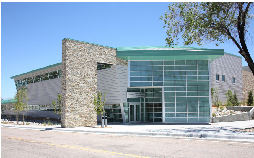
Research Center at Sandia National Laboratories

Other Requirements. Another relevant policy is the DOE ISM policy. This policy addressed all site hazards, including nanoscale materials, and requires a systematic process for identifying, analyzing, and controlling hazards. Although the policy applies to Federal organizations, the contracts for DOE site operations include a contract clause that invokes ISM as a requirement at DOE sites.