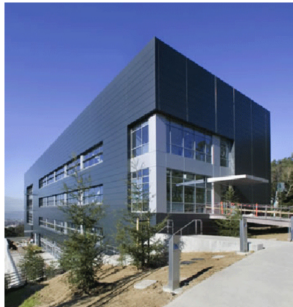
Research Center at Lawrence Berkeley National Laboratory

Requirements Management. BNL has developed effective mechanisms for ensuring that DOE expectations for nanomaterial safety are incorporated into the site requirements management system. To ensure that requirements are institutionalized and communicated, BNL has established procedures in its standards based management system (SBMS) for implementation of DOE policy and the NSRC Approach Document related to nanoscale material ES&H. Also, the BNL Director has established an Institutional Nanoscale Science Advisory Committee to provide information and guidance, ensure effective SBMS implementation and approach strategies, and ensure that nanomaterials are used properly and safely at BNL. Further, BNL management has placed emphasis on adherence to controls in order to mitigate any dispersion of free nanoparticles to work areas, the environment, or waste streams. ORNL has used a similar approach to incorporating the NSRC Approach Document into their SBMS and is working to further define site-specific expectations in supplemental institutional requirements.