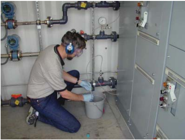
Work at LLNL

The 2004 Independent Oversight inspection identified a concern with the ability of the Building 332 room exhaust system safety class HEPA filters to perform their safety functions for evaluation basis fires. The HEPA filters' ability to survive this event as a result of combustion product accumulation and differential pressure increase to, in some cases, a level above the rated value (10 inches water column) was not demonstrated. The HEPA filter could rupture, exposing