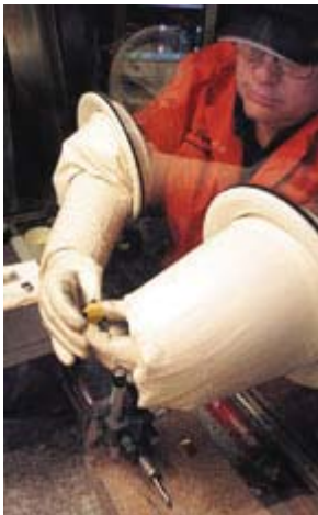
Glovebox Work in the Superblock

LLNL and LSO have not adequately addressed some previously identified deficiencies in the Building 332 safety systems, and there are a number of deficiencies in the reviewed safety systems' engineering design and authorization basis. Deficiencies were identified in several