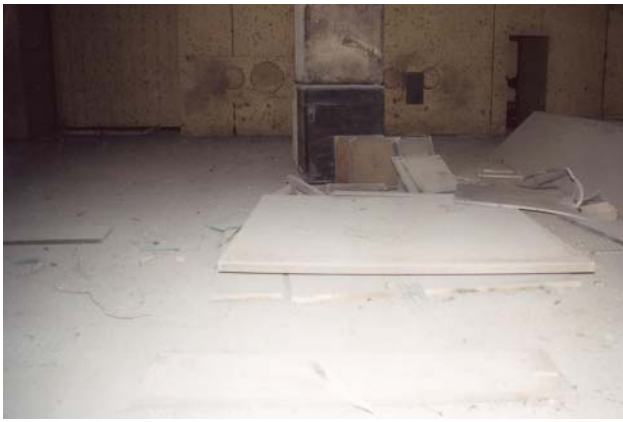
A CFF Chamber after an Explosive Test

system that recycles most of the water for future washes. Consequently, wastewater from the facility is minimized, and the only solid beryllium waste products classified as California combined waste are the polishing filters from the water cleaning system, which contain both hazardous beryllium particulate and radioactive waste. The remainder of the solid waste leaves the Contained Firing Facility chamber as low-level radioactive waste. The cleanup process is effective enough to result in a Contained Firing Facility chamber essentially free of removable beryllium and radioactive contamination (as determined by extensive sampling following previous cleanups), thereby significantly reducing the exposure potential to workers and allowing the majority of the setup activities for the next shot to be performed without respiratory protection.