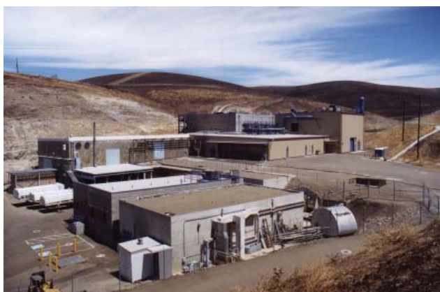
Facilities at the CFF

In most cases, 801 complex work observed by the Independent Oversight team was appropriately authorized and verified ready, and was performed within established controls. Workers were knowledgeable of