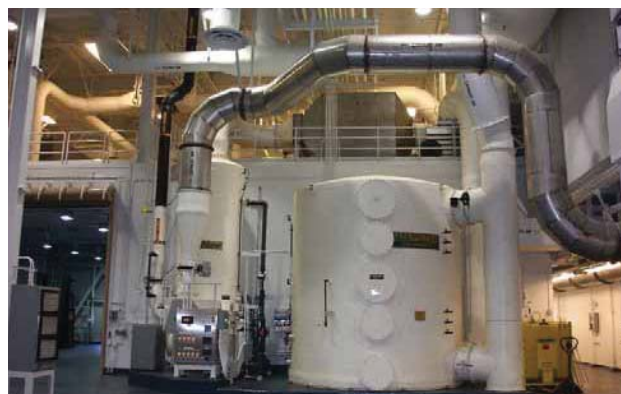
Decontamination and Waste Treatment Facility

Hazards analyses performed in connection with IWSs, bridging documents, and facility point-of-contact interfaces have gaps where hazards can be missed. The use of trade/service IWSs rather than activity-specific IWSs places too much emphasis on the individual worker's knowledge and skill, often