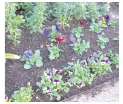
Because you have provided enough space for growth between each plant, when you're finished it will look a lot like the photo above. Use slightly moist soil and irrigate quickly following planting. Keep moist the first week, but don't drown your plants. Use a moisture meter.

thing. Because these are single season plants, they will not have deep roots when it comes time to putting in some summer annuals. As you can see from the photos below the changeover is kind of like changing bulbs in a lamp. If you want to know more about winter annuals, irrigation and any of the other issues related to sprucing up your landscape or garden log onto <u>www.starnursery.</u> <u>com</u> and click on "Best Advice." The Seasonal Gardening Tips and Star Notes are provided free to help improve your gardening experience and success.