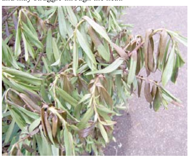
Oleander with winter drought stress

Most often the plant does not completely die, but by the time the warm season arrives it will look like heck, and may struggle through the heat.