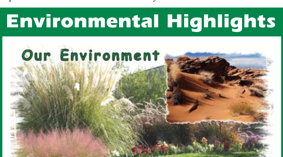
Star Nursery is your community partner and shares a dedication to helping improve & green-up our environment through better understanding and techniques.

We do have relatively cold winters, so many frost tender plants may only live one season. That's why Star Nursery provides growing and cultural requirements for the plants you buy right on the sign in front of each plant. Ask our trained plant specialists if you have more questions. They'll be happy to help you.