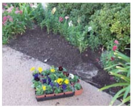
First you'll need to clear out the old flowers or plants to make way for the new, like they've done here at Angel Park Golf Course. Add some organic compost to the dirt. If the soil hasn't had plants before; add a lot of organic amendment. Rich soil helps to make healthy flowers.

Having a reasonable amount of evergreen plants to keep your yard green during the winter is a good idea. Adding winter color to those highly visible areas in your landscape is very smart when you'd like to make your place a standout and improve the quality of your neighborhood. And changing annuals is not a difficult