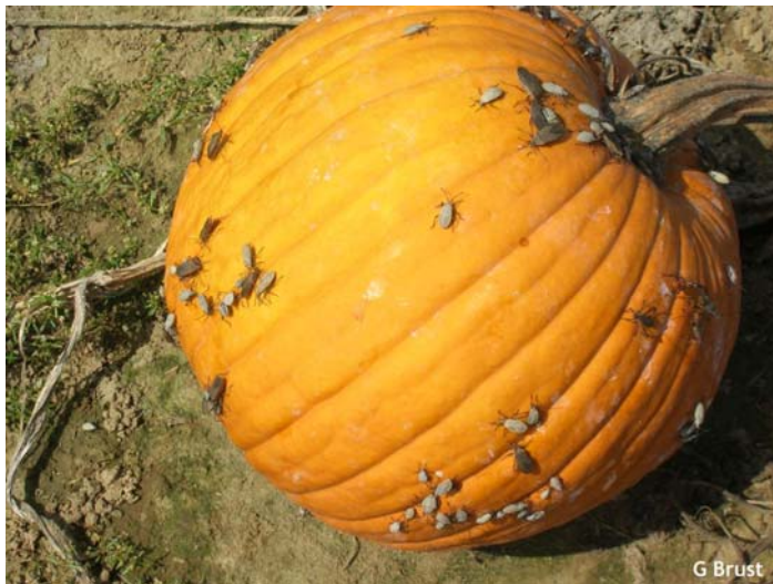
Figure 1. Squash bugs feeding heavily on pumpkin fruit because no vines are left in the field

It is that time of the year again; as the season winds down some late season pests can come in and ruin what is left of a dwindling crop. In pumpkins it could be “rind worms” which are any number of caterpillar species that will feed on the outside of a pumpkin and scar the surface or penetrate into the rind. Either way it opens the pumpkin up to secondary infection and causes it to rot much sooner than it should. The other big pest is the squash bug, which will concentrate its numbers and feeding on the pumpkin fruit if the foliage goes down and is no longer there (Fig 1). The nymphs and adults can feed heavily enough that they will “deflate” a pumpkin or reduce its vigor (including the stem) by sucking all its juices out. Any of these pests can be easily controlled with an insecticide application like a pyrethroid; the difficulty is making sure to catch the problem before it becomes too late.