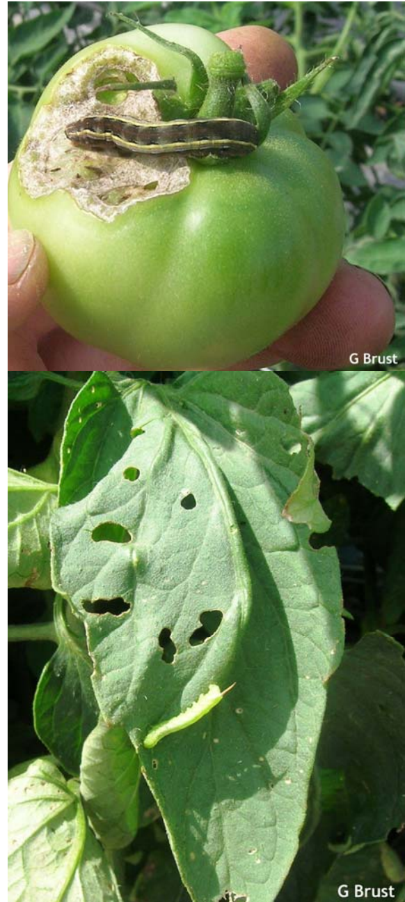
Figure 2. Large worms tend to feed on the fruit while small worms tend to feed on foliage, except for fruit worms, which will feed on the fruit when they are both very small and large larvae. They usually start feeding under the calyx or cap of the tomato as in Fig 3.

high tunnel tomatoes where they tend to feed on the fruit when they become medium size or larger. Smaller larvae tend to stay on the foliage (Fig 2).