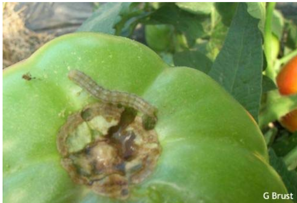
Figure 3. Tomato fruit worm feeding under calyx of tomato fruit

Tomato fruit worm, however will attack the fruit when the larvae are very small or large (Fig 3). As with pumpkin pests the tomatoes in high tunnels need to be watched carefully for the next several weeks until we have a frost or two. Bt products will work well as long as worms are small and not attacking the fruit, but other chemicals such as pyrethroids or Avaunt or SpinTor or Lannate will be needed if the worms are large or damaging the fruit.