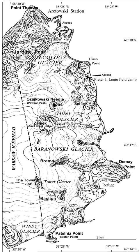
ASP A 128 Map C*