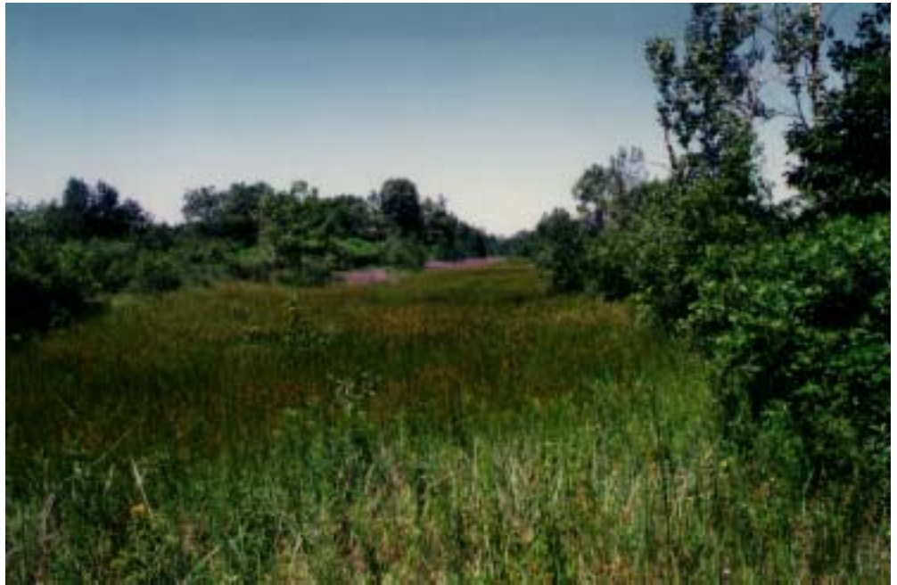
The globally rare dune and swale ecosystem is unique to a small geographic area in northwest Indiana.

As a result of the information collected during the damage assessment, the United States and the State of Indiana were able to settle claims for natural resource damages associated with the Midco I and Midco II contamination. The settlement included the purchase of the largest remaining unprotected tract (253.8 acres) of dune and swale habitat in Indiana, known as the Bongi