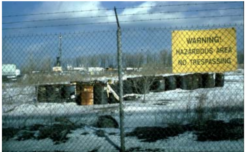
Inadequate storage methods allowed chemical waste to contaminate the site.

Beginning sometime before 1973 and continuing until approximately 1980, the Midwest Solvent Recovery Company (Midco) operated an industrial waste recycling, storage, and disposal facility located within the Lake Michigan watershed in Northern Lake County near Gary, Indiana. Midco accepted waste at two locations referred to as Midco I and Midco II. Sludges and residues were dumped into pits and industrial wastes were stored openly and stockpiled in 55-gallon drums.