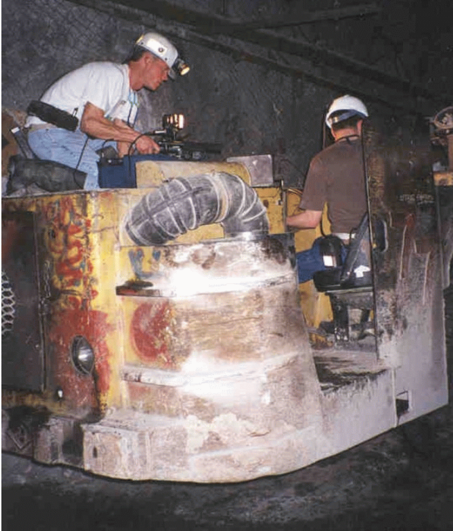
Figure 1.—Hazards In Motion.

Mention of any company name or product does not constitute endorsement by the National Institute for Occupational Safety and Health.