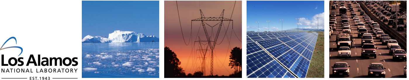
We are applying our unique scientific capabilities to the challenges of global climate change and energy security.