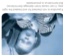
If jaundice is not checked for and treated the right way, it can cause brain damage (kernicterus). But kernicterus is preventable.

Before you leave the hospital ask your doctor or nurse about a jaundice bilirubin test for your baby.