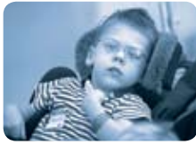
If jaundice is not checked for and treated the right way, it can cause brain damage (kernicterus). But kernicterus is preventable.

For more information, visit www.cdc.gov/jaundice