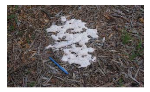
Figure 2. Closeup of Fuligo sp. on wood mulch