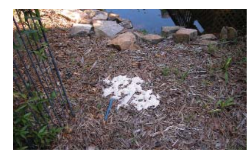
Figure 1. Fuligo sp. on wood mulch

crusty masses that resemble dog vomit or scrambled eggs (Figures 1 and 2). These are the most commonly seen slime molds in the landscape. Sometimes slime molds may use landscape plants for support, giving them an unsightly appearance (Figure 3).