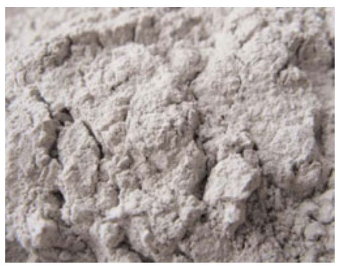
Figure 3. Pulverized limestone has a very fine texture and is more easily applied with a drop spreader.