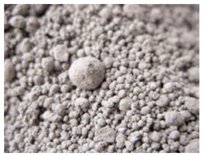
Figure 4. Pelletized lime can be applied with either a drop or rotary spreader.

Additional fact sheets available at <u>http://</u><u>publications.uaex.edu/</u>.