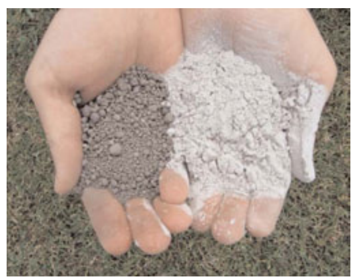
Figure 2. Comparison of pelletized lime (left) and pulverized limestone (right).

Liming materials with a fine particle size such as pulverized limestone may be difficult to distribute accurately with a rotary spreader but can be more easily distributed with a drop spreader (Figures 2 and 3). Lime can be pelletized so that many small particles are bonded together, which allows the product to be more easily applied (Figure 4). Pelletized liming materials can be distributed with a rotary spreader or a drop spreader.