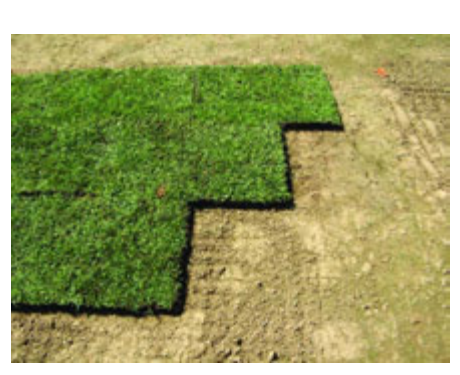
Figure 4. On each row of sod, stagger the joints as when laying bricks.