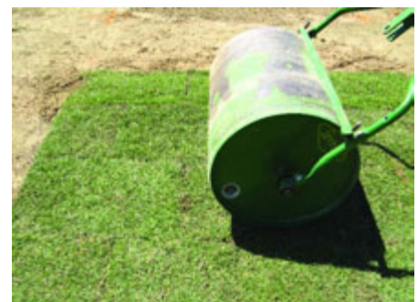
Figure 5. Rolling eliminates irregularities and establishes good contact between the sod and soil.

Lay sod soon after it is delivered. The longer the sod sits on the pallet, the more it will deteriorate. This is especially important when dormant sodding. Laying dormant sod quickly after delivery will help protect the sod from freeze injury because of the latent heat in the soil. Lay the first strip of sod along a straight edge, such as a driveway or sidewalk, with subsequent strips placed parallel and tightly against the first strip. If there are only curves, lay at right angles to the curve. In irregular areas, use a string to establish a straight line (Figure 3). Butt joints tightly to prevent root drying, but do not overlap (Figure 4). On the second row, stagger the joints as when laying bricks (Figure 4). Use a sharp knife or sod knife to cut sod to fit curves, edges and sprinkler heads. Try to avoid short or narrow strips because they tend to