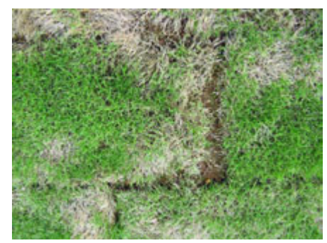
Figure 12. Too much space between sod seams during installation will cause drying.

Printed by University of Arkansas Cooperative Extension Service Printing Services.