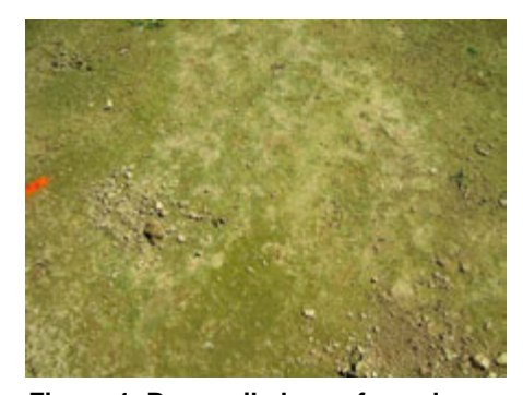
Figure 1. Bare soil clean of weeds prior to sod installation.

Redistribute or add topsoil. This is necessary on sites with poor soil fertility. Approximately 19 cubic yards of topsoil create a layer 6 inches deep over 1,000 square feet. If suitable topsoil is not available, modify the existing soil. If the topsoil lacks organic matter, incorporate peat, decomposed manure, composted chicken litter or composted rice hulls at 1 to 3 cubic yards per 1,000 square feet. Mix these materials with the native soil at least 6 to 8 inches deep.