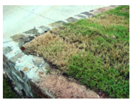
Figure 9. Sod edges drying out on this newly sodded bermudagrass lawn.