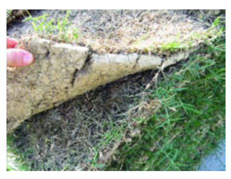
Figure 13. Do not purchase sod more than 24 hours after harvesting. Plant fresh material.