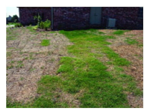
Figure 10. Winterkill of bermudagrass sod laid in early winter due to insufficient irrigation during winter (left and right). Some areas were resodded in late winter and survived (center).