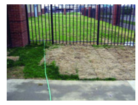
Figure 7. Inadequate irrigation distribution on a newly sodded bermudagrass lawn.

Lack of irrigation or inadequate irrigation during summer, especially to sod edges (Figures 7-9)