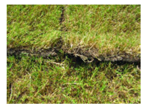
Figure 11. Overlapping sod seams during installation will cause desiccation.

Fishel, F.M., and G.E. Coats. 1994. Bermudagrass ( Cynodon dactylon ) sod rooting as influenced by preemergence herbicides. Weed Tech . 8(1):46-49.