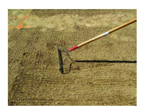
Figure 2. Loosening the soil to a depth of 0.5 inches prior to sod installation helps with rooting.

heavy steel drag mat, soil blade, plank drag or tiller. Allow one week for the soil to settle before final grading. Irrigation or significant rainfall will aid in settling the soil. A properly prepared planting bed should be firm enough to walk on with the top 1/2 inch of soil loosened. The soil will require further watering or rolling if footprints are deeper than 1/2 inch. During final soil preparation, examine height and slope of soil in