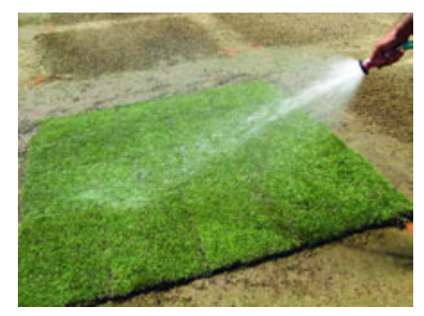
Figure 6. Begin to water the lawn thoroughly after the sod is installed and rolled.