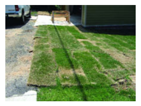
Figure 8. Inadequate irrigation of a newly sodded zoysiagrass lawn.