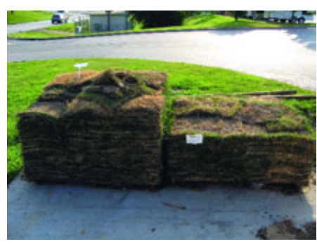
Figure 14. Do not purchase sod more than 24 hours after harvesting. Plant fresh material.