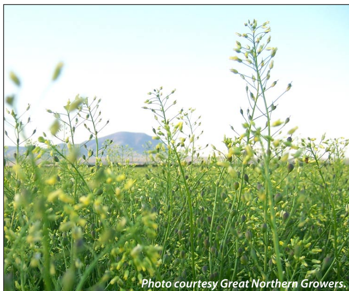
Camelina grows in a Montana field.

Specialty Olive Oil Production www.sfc.ucdavis.edu/pubs/SFNews/archive/94111.htm