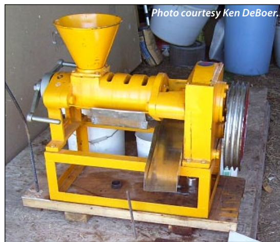
This 1-ton press was too small and slow for what its owner planned for it.

Choosing the correct size of press for what you intend to do is very important. For example, Montana farmers' experiences led to the conclusion that 1-ton per day presses