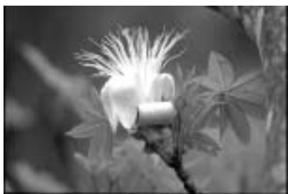
Figure 3 Boab Flower