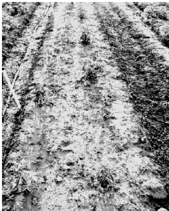
Figure 11 SO 4 treated seed