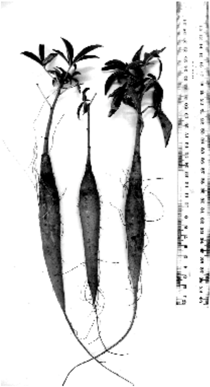
Figure 7 Typical swollen roots at 40 days of age.