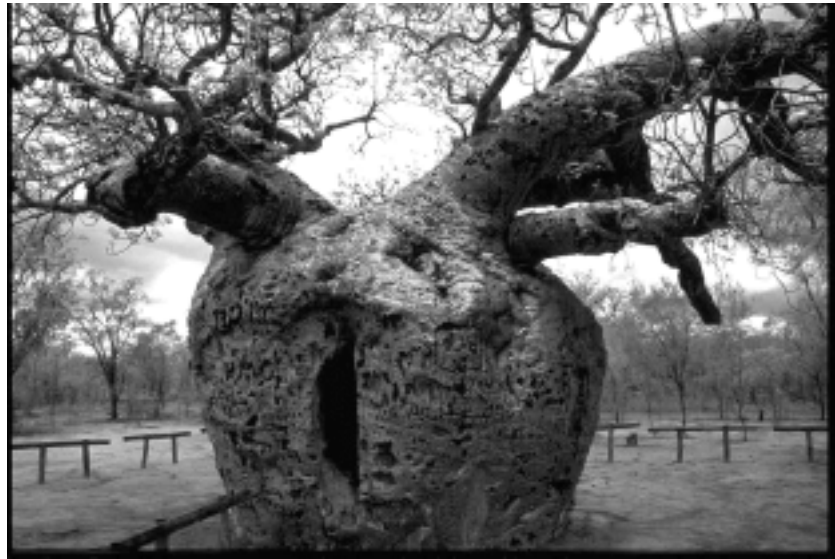
Figure 5 Mature Boab tree

The primary aim of the project in researching A. gregorii was to identify the potential of commercialising the root of the young plant as a crop. The research carried out has to satisfy product potential in all aspects of crop production through to the end market.