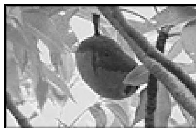
Figure 4 Boab seed pod

All of the produce is treated as a vegetable or as a seasoning (Booth et al, 1998., Dupriez et al, 1989., FAO Food Nutrition Paper, 1998., and Wickens, 1980).