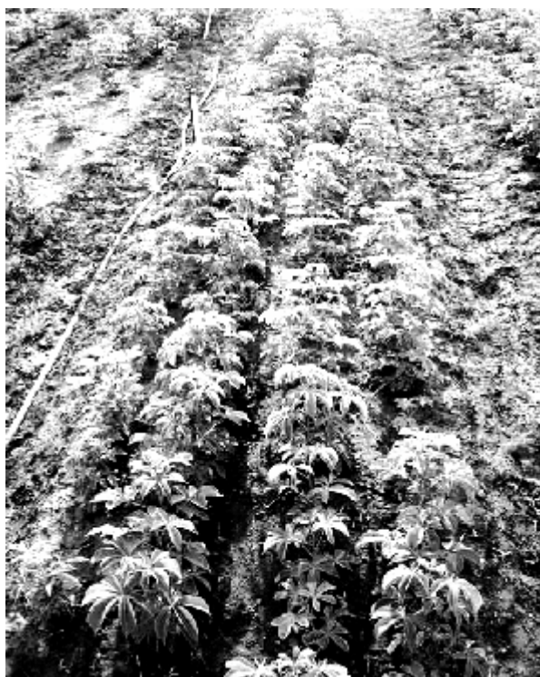
Figure 10 Double density planting

Selective spraying with a herbicide Sprayseed, spraying the weeds that were away from the germinating boab seedlings. The rest of the weeds around the boab seedlings were chipped and pulled out by hand. This process was repeated as the crop developed further.