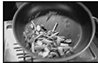
Figure 9 Test cooking Hyatt hotel