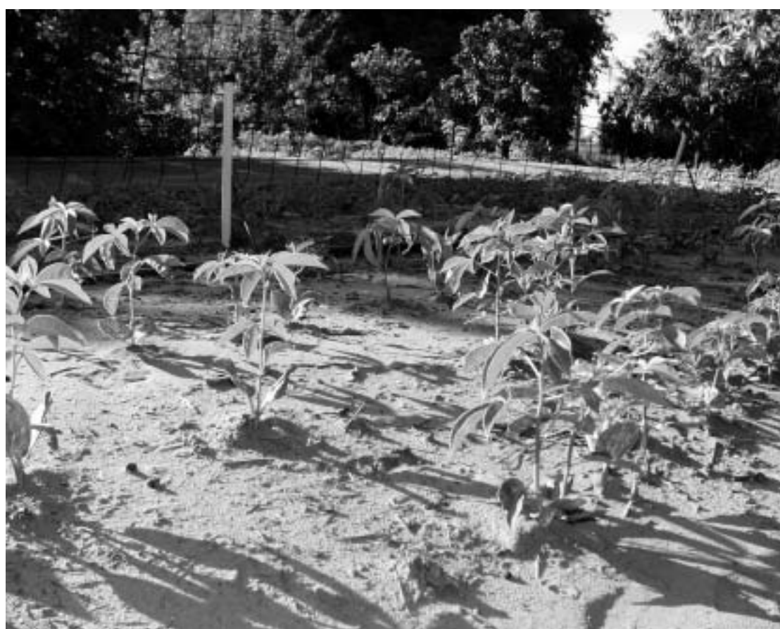
Figure 6 Initial test planting

10/3/01 – one year old seed (no sulphuric acid)