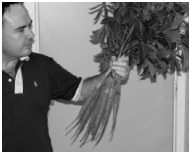
Figure 12 8 week old plants