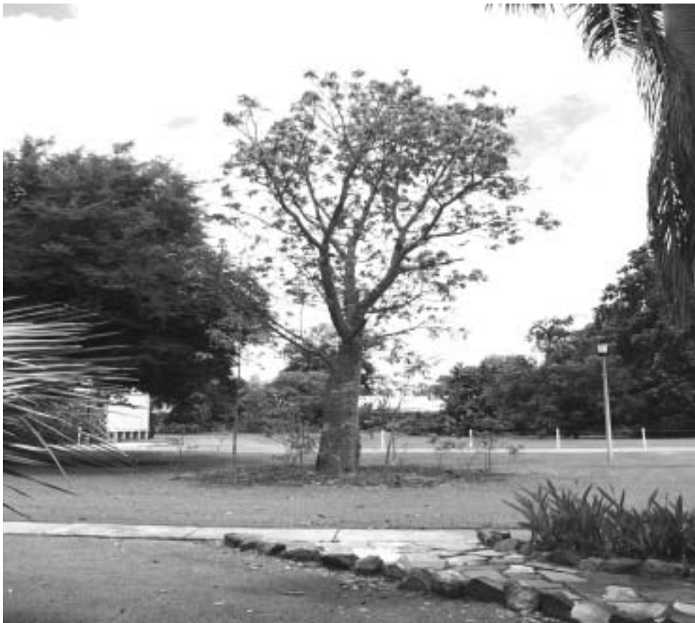
Figure 1 Adansonia gregorii A common sight in the Kimberley region of Western Australia

Australian bushfoods have come along way since early experimentation by chefs and Australian food enthusiasts. The demand for unusual and very Australian dishes has identified a range of Australian flora that can be useful food resources. Up until now the Australian Boab, Adansonia gregorii has had a very low profile as a bush food, unlike its related species in Africa, A. digitata , and Madagascar, A. greandidieri . The use of A. gregorii as a root crop food has so far been restricted to some local enthusiasts and the Aborigines of the region who have traditionally used different parts of the tree as part of their diet.