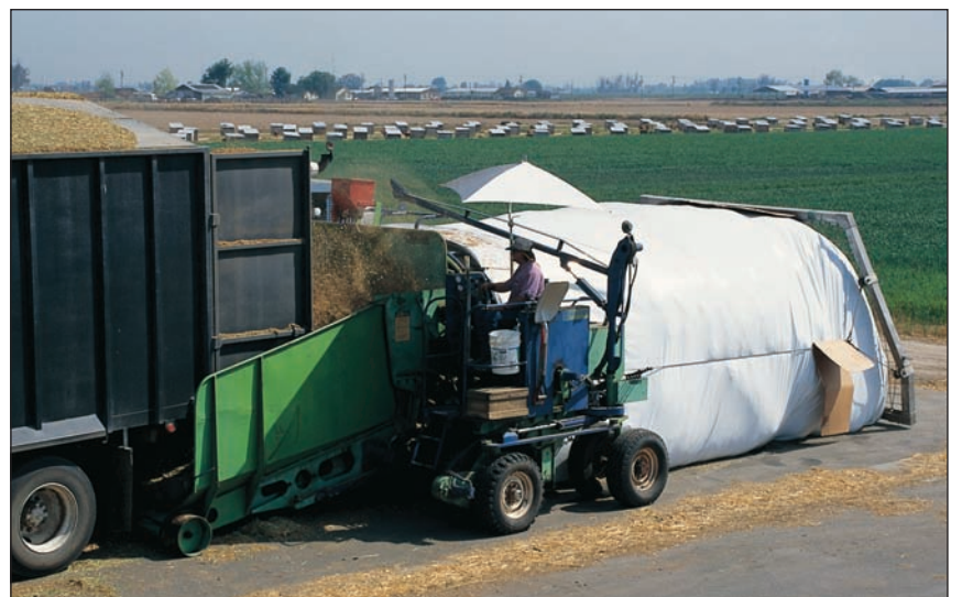
WASTE TO ENERGY incinerators, recycled plastic lumber, and deck material are some of the options for used silo bags. Logistics are still difficult.

The author is a free-lance writer in Groton, N.Y.