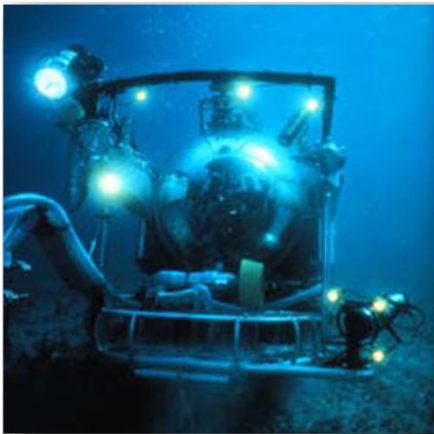
The four-person submersible, Johnson Sea Link II and an improved hydrate drill were used to recover gas hydrate in the northern Gulf of Mexico.