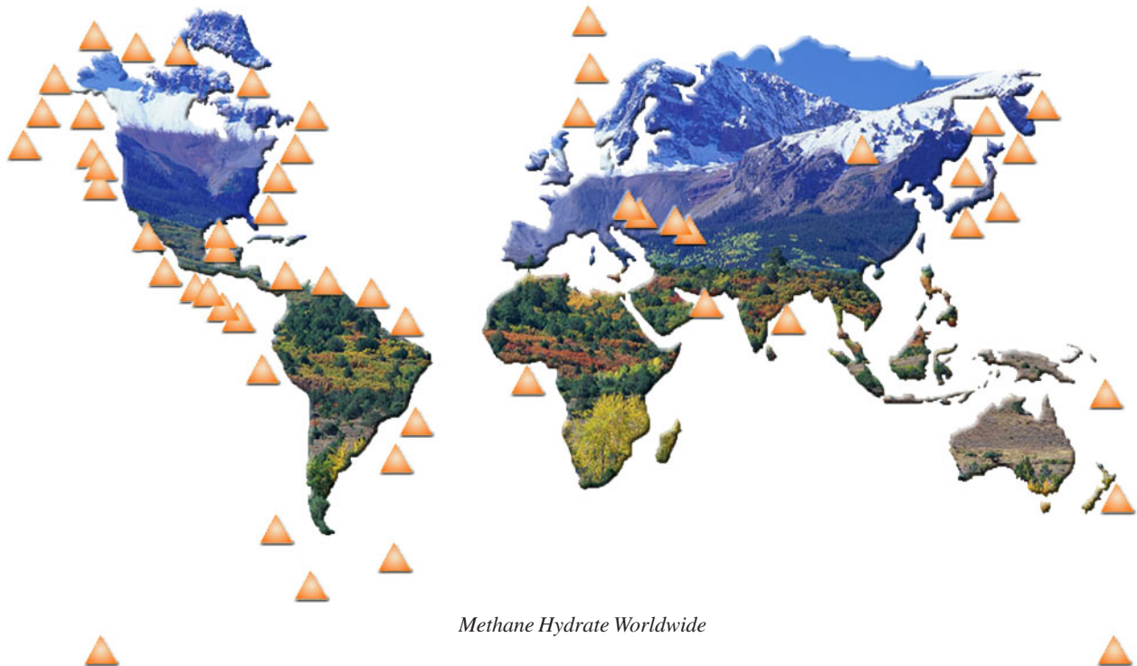
Methane Hydrate Worldwide