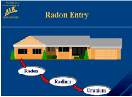
Figure 1: Decay products and vapor pathways of radon into homes and buildings.

Uranium, which is naturally radioactive, is found in rock in various locations around the world. Whether or not an area of the country has the potential to have measurable levels of radon is a function of local geology. The United States Environmental Protection Agency (EPA) periodically publishes updated maps of the location of uranium-bearing rocks and sediments and the likelihood of finding measurable levels of radon inside buildings built over these formations. This website (http://www. epa.gov/iaq/whereyoulive.html) can provide you with the estimated