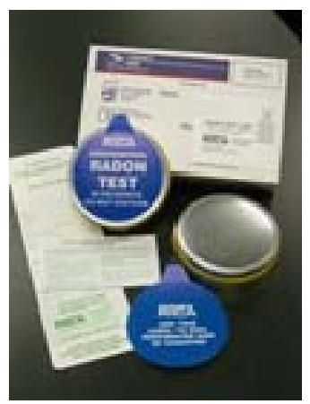
Figure 3: Commercially available home radon test kits.

The Office of Compliance has tested underground facilities in the Legislative Branch Campus and has found radon levels well below both the EPA guidelines and the OSHA exposure standards. We join with the EPA and the Surgeon General of the United States in strongly suggesting that each employee have his or her home tested.