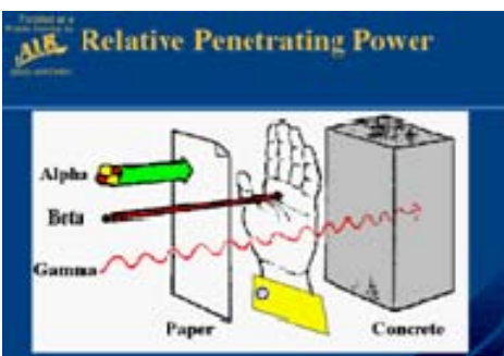
Figure 2: Alpha particles have limited penetration.

for exposure to radon gas. The Occupational Safety and Health Administration (OSHA) has a work-place exposure limit of 100 piCi/L for 40-hours over 7 consecutive work days (29 CFR 1910.1096(c) (1)). The EPA has set a standard for radon gas in the air in homes at 4 piCi/L and in water at 300 piCi/L.