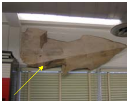
Figure 1: Dark Mold Growing on Water Damaged Wall behind Wall Paper

Molds reproduce by means of spores. Mold spores are microscopic and are naturally present in both indoor and outdoor air. Some molds have spores that are easily disturbed and waft into the air and settle repeatedly with each disturbance. Other molds have sticky spores that cling to surfaces. When mold spores land on a damp spot indoors, they may begin growing and digesting whatever they are growing on in order to