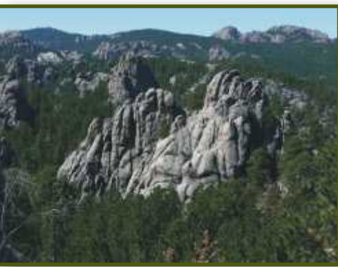
Black Hills rock formations

Geology - Black Hills geology is very complex. The Hills were formed by the uplifting of the earth's crust millions of years ago. Precambrian rock formations, consisting of slate, schist and granite, form a central core. Harney Peak at 7,242 feet and the nearby Needles are part of this core. Surrounding the central core are rings of sedimentary rocks consisting of sandstone, limestone, and shale in which occur many well-known caves, such as Wind Cave and Jewel Cave.