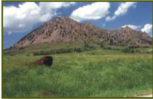
View of Bear Butte

Bear Butte - Centennial Trail begins in the north at the top of Bear Butte. At 4,422 feet, Bear Butte is a sacred place for the American Indian. The butte is a laccolith formed by a molten magma intrusion that has been exposed by erosion of the surrounding prairie lands.