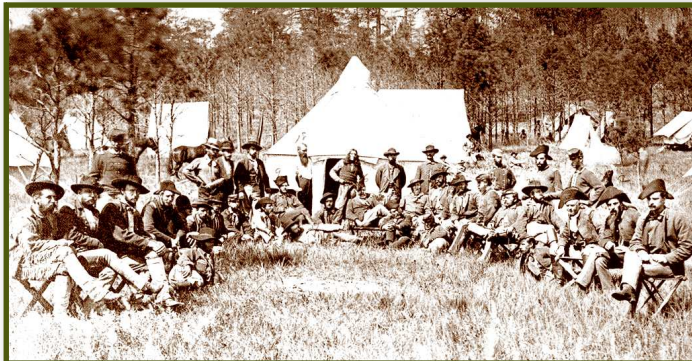
Custer and his officers

History - The Black Hills are rich in both American Indian and early American history. Archeological evidence suggests American Indian use of the area began about 10,000 years ago. The first expedition to explore the Black Hills was Custer's Expedition in 1874, two years before his death at the Little Big Horn in Montana. The Centennial Trail passes many historical sites.