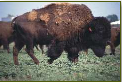
Buffalo shedding its winter coat

History - The Black Hills are rich in both American Indian and early American history. Archeological evidence suggests American Indian use of the area began about 10,000 years ago. The first expedition to explore the Black Hills was Custer's Expedition in 1874, two years before his death at the Little Big Horn in Montana. The Centennial Trail passes many historical sites.