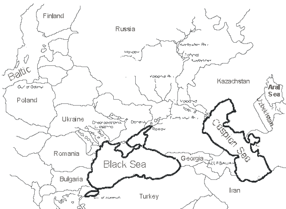
Fig. 4. Native distribution of N. melanostomus (from Sapota 2005).

N. melanostomus occurs in all shallow water regions of the Black Sea, the Caspian Sea, the Marmara Sea and in all areas of the Sea of Azov (Berg 1949) (Fig. 4). Lower abundance in the southern regions of the Black Sea (Ozturk 1998) seems to be mainly connected with the higher salinity of that area, which is caused by a lower number of riverine outflows in the region (Sapota 2005). Gobies ascend the tributaries of the Black and Caspian seas, including the Dniester River as far as the Smotrich River (near the city of Kamenets-Podolsky, Ukraine); the Yuzhnyi Bug River as far as the city of Ladyzhino, Ukraine; the Dnieper River as far as the city of Dnepropetrovsk, Ukraine; and the River Don as far as the city of Rostov, Russia (Berg 1949, Charlebois et al. 1997). In the Danube N. melanostomus is native to the delta region.