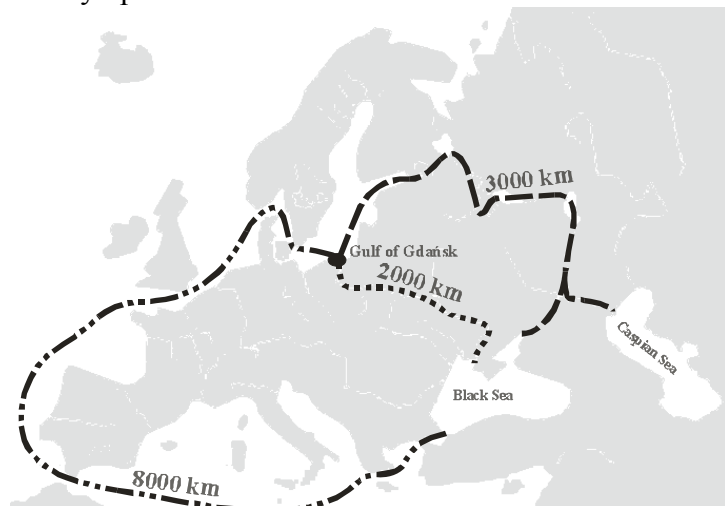
Fig. 6. Theoretical possible routes of round goby introduction into the Gulf of Gdańsk.

Transport of eggs or larvae with ballast waters seems more likely than the migration of fish. This species is not a good "swimmer" and it is difficult to imagine the fish covering such a long distance, mostly upstream.