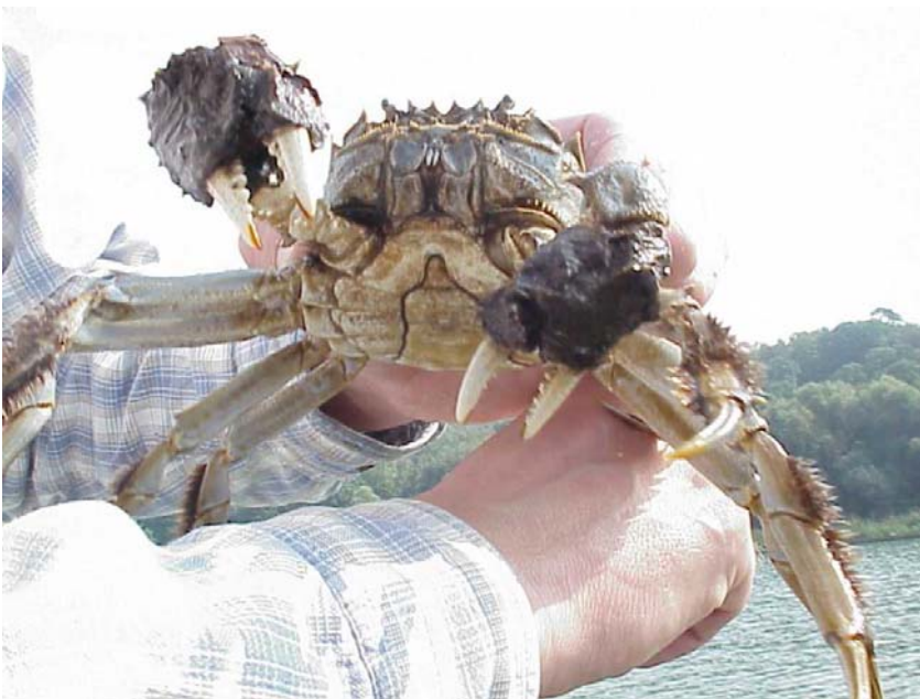
Fig. 1. Adult crab, photo by Stephan Gollasch, www.gollaschconsulting.de

Common names: Chinese Mitten Crab (GB), Chinese Freshwater Edible Crab (GB), Crabe Chinois (FR), Chinesische Wolhandkrab (NL), Chinesische Wollhandkrabbe (DE), Kinesisk Uldhåndskrabbe (DK), hiina villkäpp-krabi (EE), Kinesisk Ullhåndskrabbe (NO), Kinesisk Ullhandskrabba (SE), Villasaksirapu (FI), Krab wełnistoszczypcy (PL), Kinijos Krabas (LT), Ķīnas cimdiņkrabis (LV), Kitajskij mokhnatorukij krab (RU).