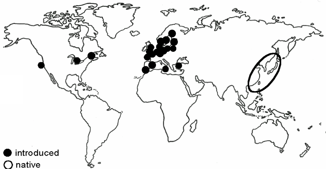
Fig. 4. World-wide distribution of Eriocheir sinensis . Drawing courtesy of Gollasch et al. 1999.

Area of origin are waters in temperate and tropical regions between Vladivostock (RU) and South-China (Peters 1933, Panning 1938), including Taiwan. Centre of occurrence is the Yellow Sea (temperate regions off North-China, see open circle on world map) (Panning 1952).