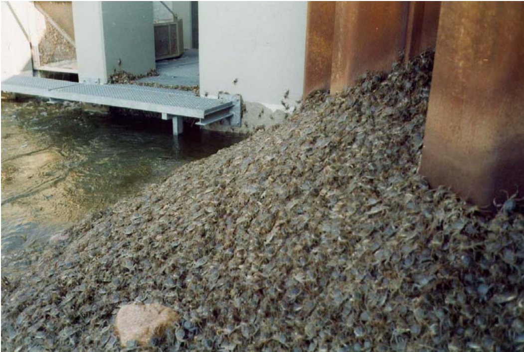
Fig. 2. Juvenile crabs during mass migration in Geesthacht (near Hamburg, Germany) in 1998.