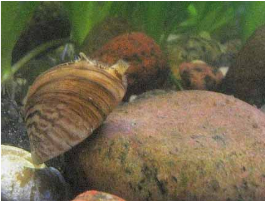
Fig. 1. Dreissena polymorpha , photo by Viktoras Didziulis.

Common names: Zebra mussel, Wandering mussel (GB), Zebramuschel, Wandermuschel, Dreikantmuschel, Dreiecksmuschel, Schafklaumuschel (DE), Vandremusling (DK), Tavaline ehk muutlik rändkarp (EE), Vaeltajasimpukka (FI), Svītrainā gliemene (LV), Dreisena (LT), Racicznica zmienna (PL), Vandringsmussla (SE).