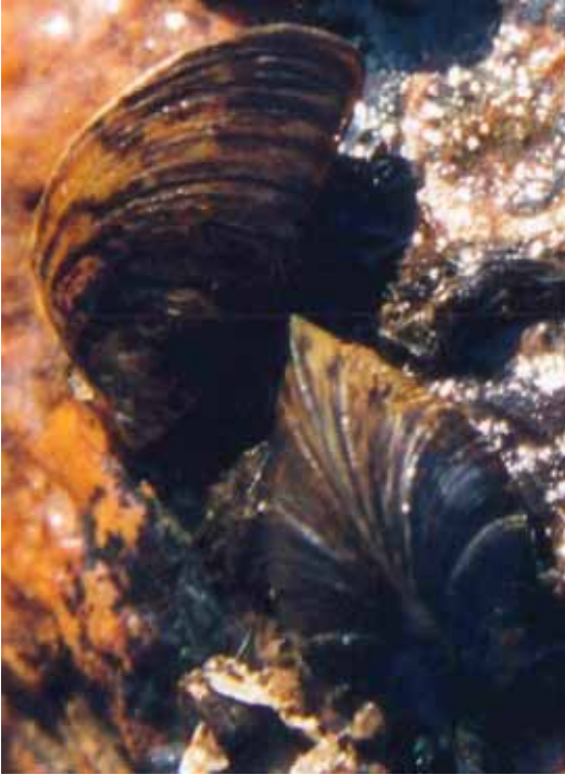
Fig. 2. Dreissena polymorpha , photo by Jonne Kotta, source: D. polymorpha fact-sheet , produced by Estonian Marine Institute.