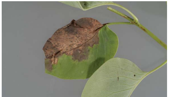
Lilac leaf blight

On Hamamelis (witch-hazel) and Parrotia , symptoms are similar to rhododendron, mainly visible at the tip and edge of leaves and are usually delimited by the veins.