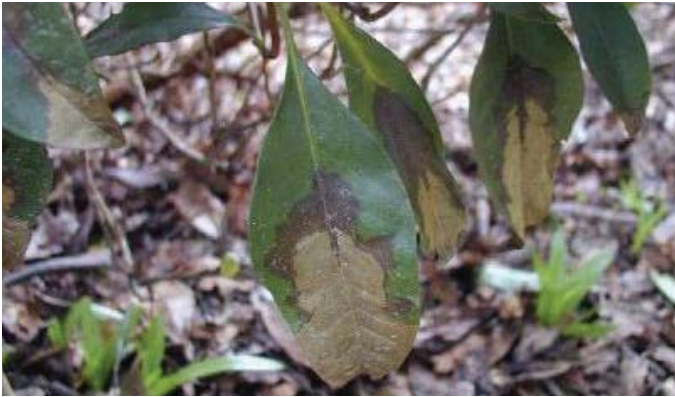
Kalmia leaf blight

On species of Camellia , Griselinia , Kalmia , Magnolia , Laurus (laurel), Leucothoe , Syringa (lilac) and Umbellularia californica , the pathogen usually only causes leaf infections. Leaf lesions are usually brown to black areas, typically occurring at the tip or edges of the leaves. On Camellia , some shoots have also been found infected leading to dieback.