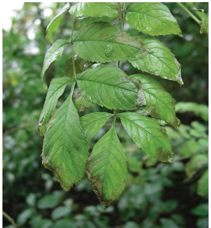
Fraxinus excelsior (ash) infected foliage

On conifers the pathogen causes a needle blight and dieback of young shoots of Douglas fir, coastal redwood and grand fir. However, natural infection of these species has not occurred in the UK.