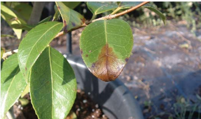
Camellia leaf blight