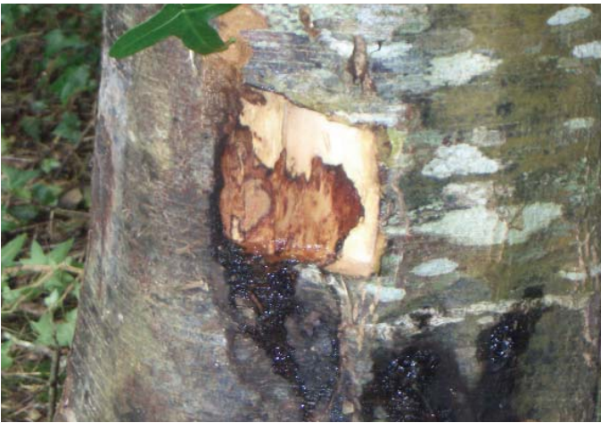
Inner bark stem lesions on Nothofagus sp.

When the outer bark is removed mottled areas of necrotic (dead and dying) and discoloured inner-bark tissue with black 'zone lines' around the edges may be seen. Diseased areas may become colonised by bark beetles. When cankers girdle the trunk, death of the tree occurs. Death can be rapid such as in tanoak ( Lithocarpus densiflorus ) in the USA, or may take one or more years, such as in American Quercus species. Cankers do not extend below the soil line and do not appear to infect the roots.