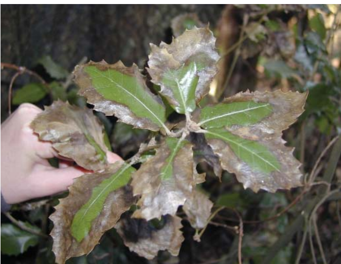
Q. ilex (holm oak) infected foliage

Leaf infections most commonly appear as brown necrotic areas, often at the edge or tip of the leaf. On broadleaved tree hosts in Europe, leaf and shoot infections have been found on holm oak, ash, Winter's bark and sweet chestnut.