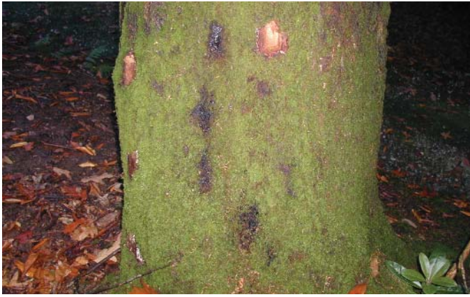
Bleeding canker on Quercus falcata (southern red oak)