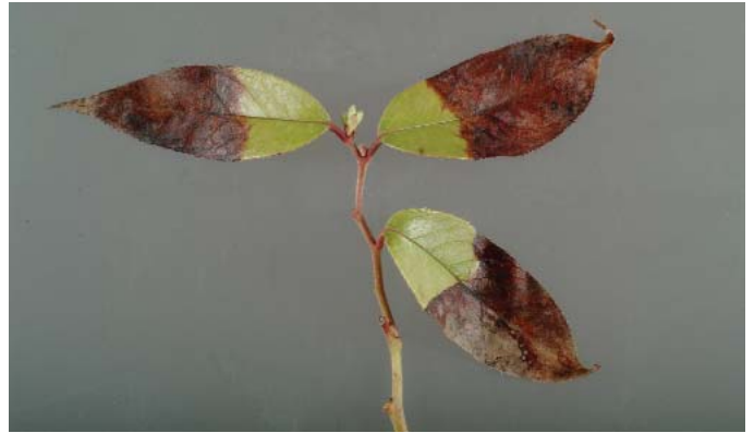
Leucothoe leaf necrosis