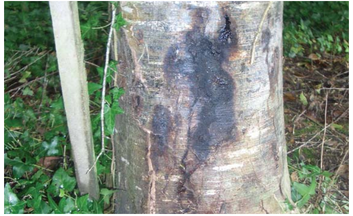
Stem lesions on Nothofagus sp. (southern beech)