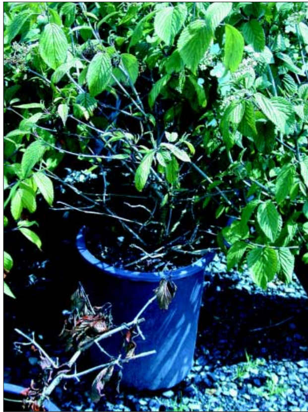
Figure 3 (above). — Viburnum plicatum var. tomentosum ‘Mariesii’ infected with P. ramorum , showing a necrotic leaf as well as defoliation near the base of the plant.

Phytophthora ramorum is a funguslike organism well adapted to the cool, wet conditions of the Pacific Northwest and at the same time tolerant of heat and drought. Unlike most Phytophthora species that infect roots, P. ramorum is mainly a foliar pathogen. It produces several spore types, which helps the organism survive and spread (Figure 4). Spores landing on wet leaves or stems germinate and infect the plant. Young leaves are especially susceptible. Within a few days, sporangia are produced, and they release tiny,