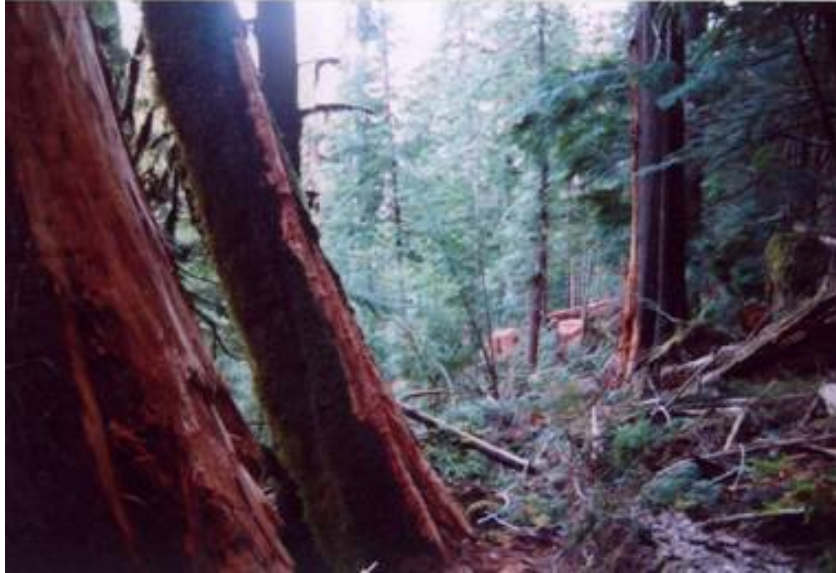
A Faller is never really out from under the canopy working in a safe opening when doing retention work.

Currently, WCB's way of dealing with things is they chose to not visit these sites until there's been another crippling accident involving one of us. When WCB and the Fallers come together for a meeting over one of these accidents that have just taken place, the Board will give us a talk on SOP and Safe Practices, the Fallers all bob their heads in agreement, WCB goes home, the Fallers head back to their tools, nothing has changed! Retention falling will not permit this.