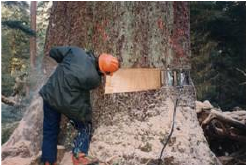
When the falling of oversized timber is taking place under extra ordinary circumstances, make sure your Fallers have proper jacks.