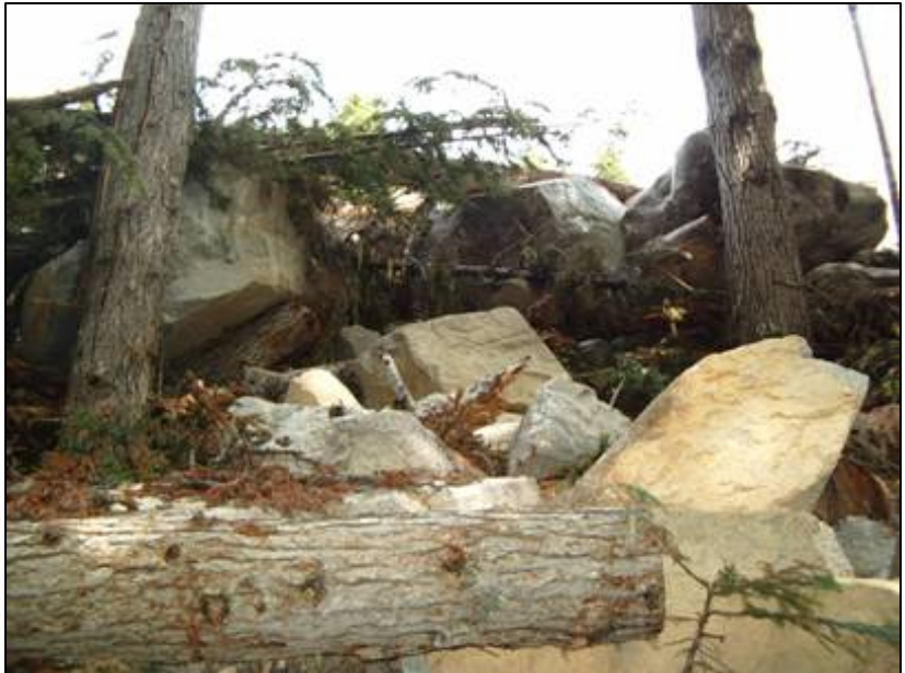
The road that was installed where these two trees got brutally damaged was on level ground, this was NOT necessary!

When we look at some of the Right of Way (RoW) allowances that have been laid out to access some areas of timber, there is no doubt in our minds, it was impossible for the road builders to keep debris out of our quarters on the low side of the road. Fallers can accept this.