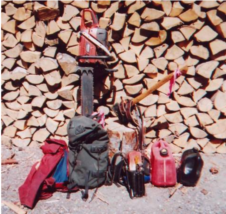
Soon as a Faller leaves the Crummy in the morning he has some form of weight attached to him until he returns at night.

Packing these weights on a daily basis is part of our general job description; could they be classified as contributing factors, most certainly, but there won't be much timber hitting the ground without any of the aforementioned gear. It will become evident further along why we've listed this. The weights are accurate, if anything, they're a little on the conservative side.