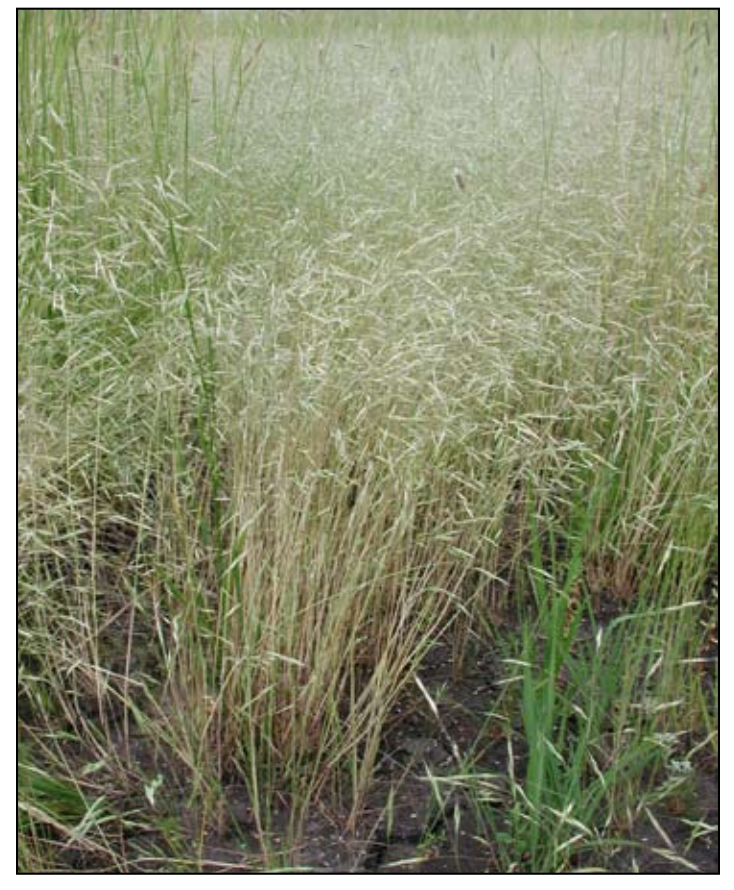
Ventenata (light brown plant in photo) invades ground that is exposed due to poor stand establishment, erosion, or declining stand health. (Pamela Scheinost, NRCS Pullman PMC)

Ventenata infestations seriously degrade the quality of hay, pastures, and CRP fields, as well as native range