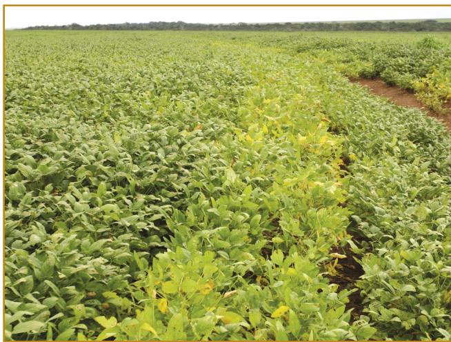
The yellow areas in this field show areas of fungicide sprayer skips, resulting in soybean rust infection.

For the most effective control, experience with soybean rust in Brazil suggests that droplets should be fine- to medium-sized (a volume median diameter of about 200 \mu\text{m} ). Of course, such tiny droplets have a greater potential to drift than large droplets (the size commonly used for herbicides). Fungicide drift may not cause obvious symptoms in nontarget plantings (unlike herbicide