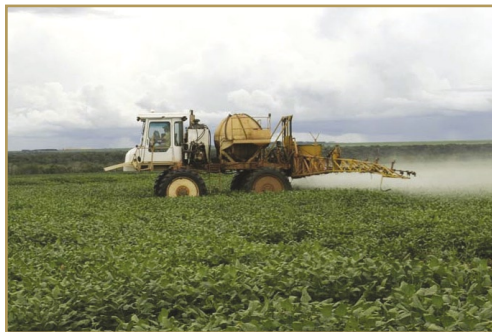
A sprayer applies fungicide to a soybean field in Mato Grosso, Brazil.