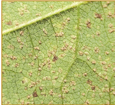
Asian soybean rust pustules on the underside of a leaf.