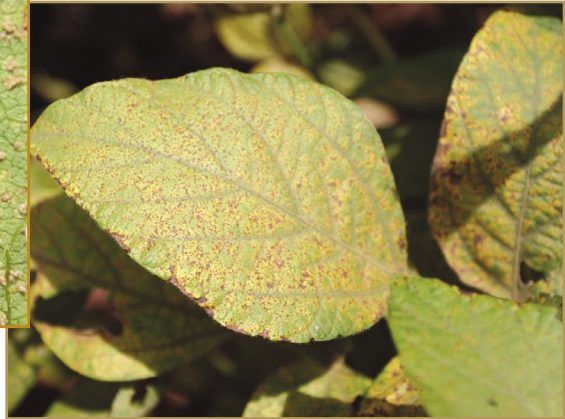
A soybean leaf heavily infected with Asian soybean rust.