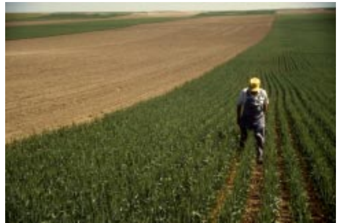
Figure 4. Carl Mortensen, Jr., has found that stripcropping reduces wind erosion and winterkill problems on his Kimball County farm. Soil type is one factor that determines the width of strips. Strips should be arranged perpendicular to the prevailing wind direction.

suffer. For example, planting rainfed sunflower at too high a population for a given site may result in weakened stalks that break more easily, resulting in a shorter stalk height and reduced silhouette area. Despite their smaller stalk diameter, small grains usually do a better job of reducing wind erosion than crops like corn or sunflower because they have many more stalks per given area ( Table II ).