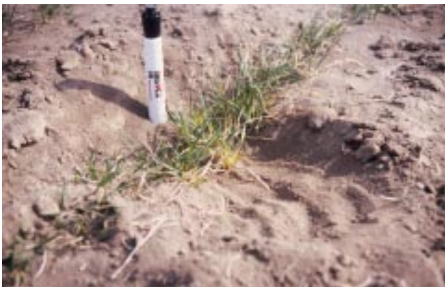
Figure 1. Blowing soil fills seed furrows and partially buries small wheat plants in the spring, resulting in increased plant stress that weakens the plants and makes them more susceptible to further damage by disease and other environmental stresses.