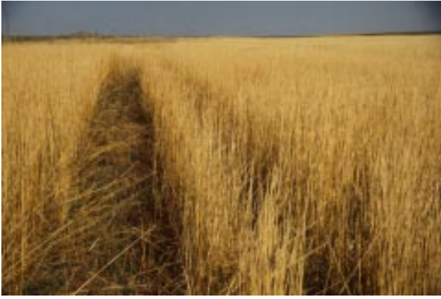
Figure 3. This wheat field south of Sidney, Nebraska was harvested with a Shelborne Reynolds Combine Stripper Header. The use of a stripper header for wheat harvest can leave a tall wheat stubble that provides excellent protection against wind erosion. Additionally, a taller stubble has been found to decrease soil water loss through evaporation, reduce weed infestations, and catch and retain more wind-driven snow in fields where the extra moisture can significantly increase the yield of the following crop.