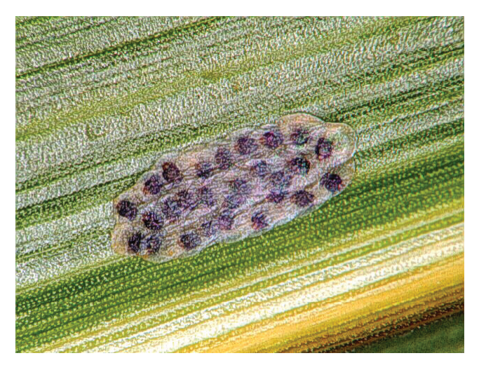
Figure 2. Black head stage European corn borer egg mass.

This worksheet will be useful in closely evaluating the many factors influencing the cost/benefit relationships involved in treating second generation European corn borers. Average values are suggested in the worksheet and may need to be modified in certain situations: