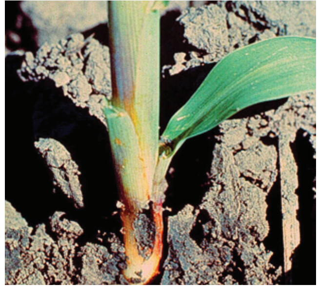
Figure 4. Cutting at the base of corn plant by black cutworms.

Economic thresholds have not been researched for this insect, but use of thresholds similar to those for cutworms has been suggested. The same insecticides labeled for post-emergence use against cutworms would be appropriate for southern corn leaf beetles.