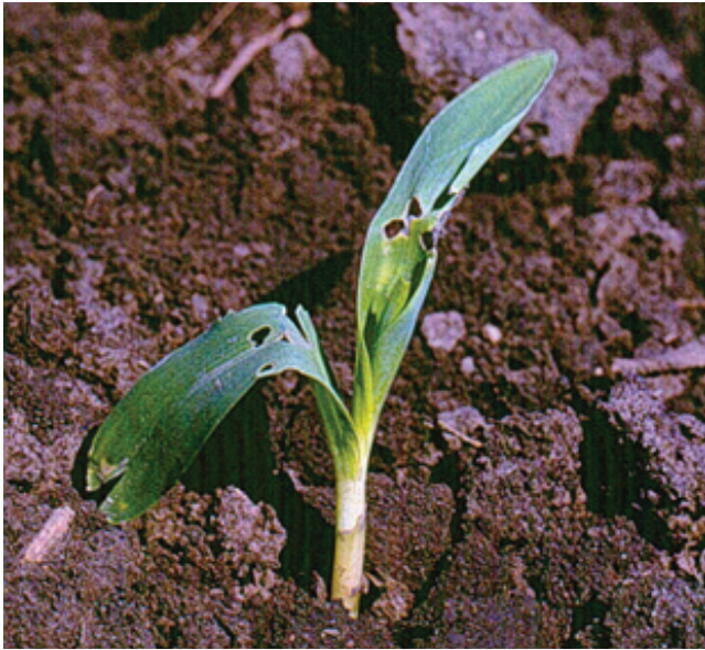
Figure 3. Leaf feeding by small black cutworms on corn.