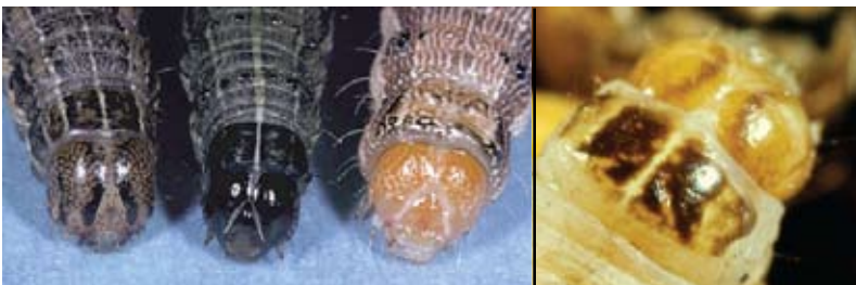
4. Armyworm 5. Fall Armyworm 3. Corn Earworm 2. Western Bean Cutworm