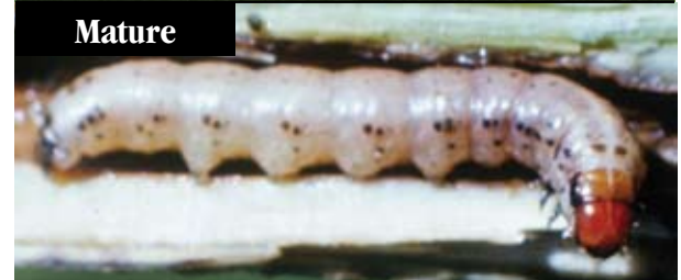
6. Common Stalk Borer

For more information on Nebraska corn insect identification and management, visit the University of Nebraska–Lincoln Department of Entomology Web site at entomology.unl.edu