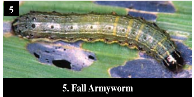
5. Fall Armyworm