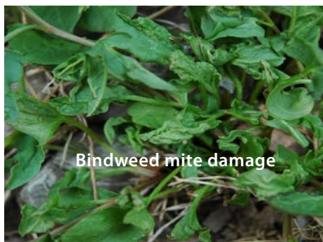
Bindweed mite damage

Establishment of selected grasses can be an effective cultural control of field bindweed. Contact your local Natural Resources Conservation Service for seed mix recommendations. Maintain healthy pastures and prevent bare spots caused by overgrazing. Bareground is prime habitat for weed invasions.