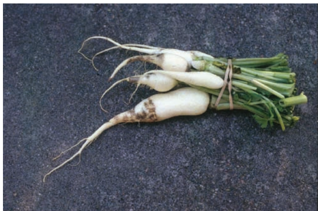
Figure 2. Rhizoctonia on radish roots.

• Do not apply excessive amounts of nitrogen early in the season, especially forms of ammonium such as urea or ammonium nitrate. High nitrogen, either in the soil or in the crop, increases the pathogenicity of Rhizoctonia . The level and form of fertilization you choose for your crop