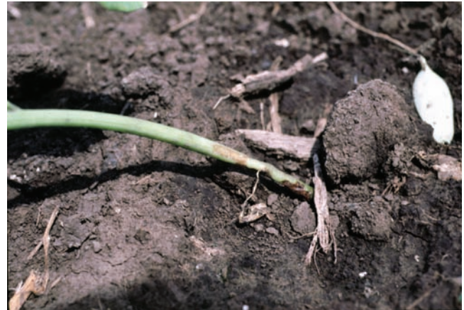
Figure 1. Rhizoctonia on snap bean stem.

Rhizoctonia has a strong saprophytic ability in soil, a high degree of pathogenicity, and wide host range. This means that it can live well in soil on decaying plant material. Since it is almost always present in soils, the goal is to minimize its opportunities to infect crops (become pathogenic). Weakened