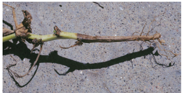
Figure 5. A complex of the fungal root rots on a pea root.

Several pathogenic fungi, occurring singly or as a complex, infect pea seeds and roots from planting until