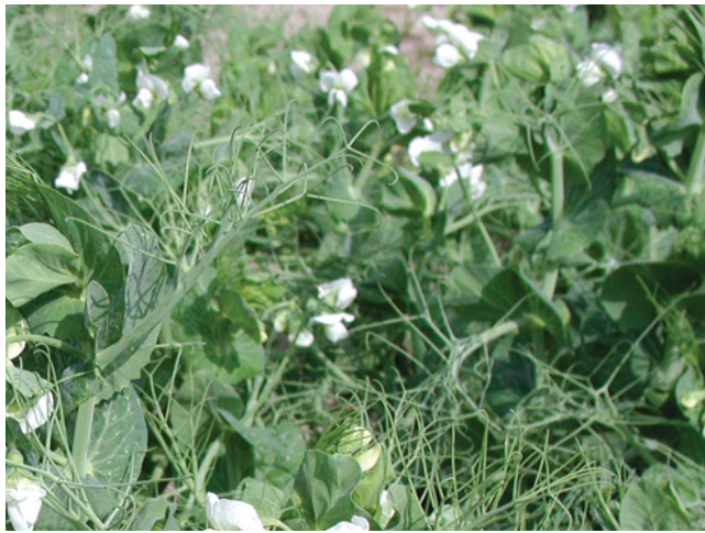
Figure 2. Semi-leafless type pea with white flowers.

maturity, unless planted with a small grain. The other type is semi-leafless, which has modified leaflets reduced to tendrils (Figure 2). This type has more tendrils and shorter vine lengths of two to four feet, which gives semi-leafless types better standability at harvest.