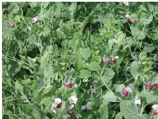
Figure 1. Normal leaf type pea with blue flowers.

Pea is an annual cool-season legume that grows best when average daily temperatures are 55-65°F. Pea plants range in height from two to five feet. Leaves consist of up to three pairs of leaflets with a terminal tendrils. Tendrils are modified plant parts that coil around objects and help support and elevate the plant.