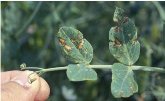
Figure 6. Bacterial blight on pea leaves.

Bacterial blight, caused by Pseudomonas syringae pv. pisi , is commonly found throughout the High Plains, but incidence and damage is generally low (Figure 6). It can be destructive during periods of cool, damp weather, particularly if the crop was previously damaged by hailstorms. The pathogen is often seedborne, which directly infects young seedlings. The bacterium can also live on various weed species and other plants and can spread to neighboring, healthy plants through wounds and rain splashes during storms.