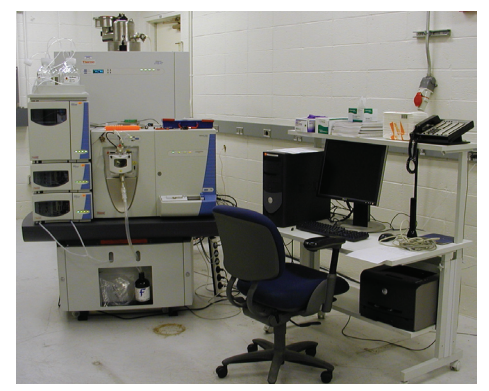
LC-ICR-LTQ mass spectrometer for high resolution mass measurement

Metabolites, the intermediates and products of metabolism, including energy storage and management molecules, secondary metabolites, and various signaling molecules, are precursors to macromolecules such as proteins and complex carbohydrates. They are also found as regulators of gene expression and thus control which proteins are made in a cell. Los Alamos National Laboratory researchers are studying metabolomics to help us learn what kind of metabolism a cell uses, how it manages energy, even how these pathways