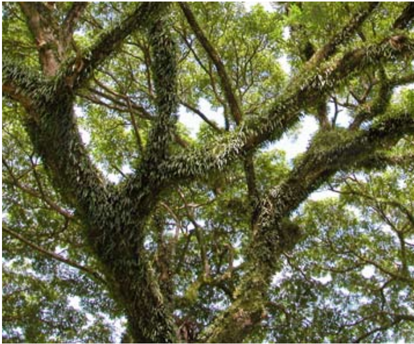
Rain tree makes a remarkable habitat for epiphytes such as ferns and orchids, particularly in wetter areas.