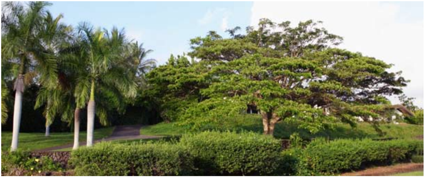
The size of rain tree limits its use in crowded urban lots. However, if enough space is available, the tree makes a wonderful landscaping tree.