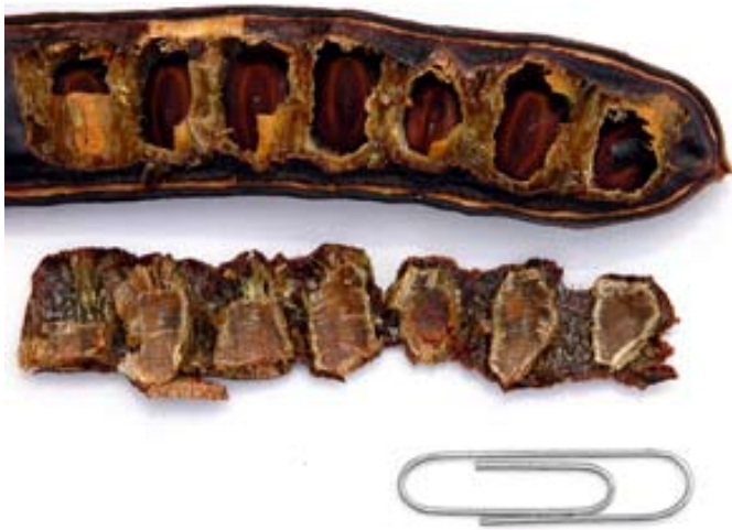
Seeds in pod. Note sticky pulp surrounding the seeds.