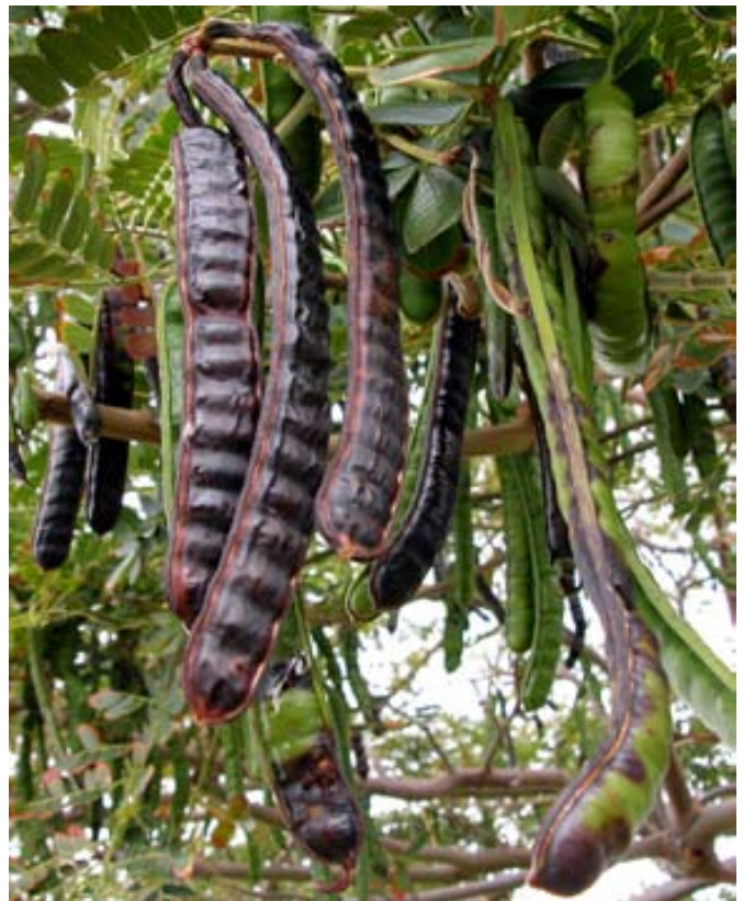
Top: Flowers and new leaves. Bottom: Fruit in varying stages of ripeness.