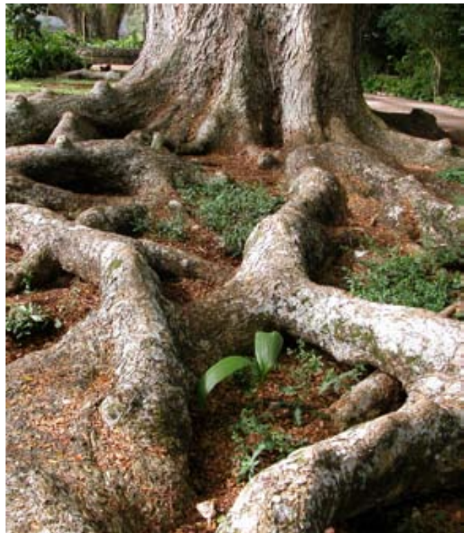
Rain tree has an extensive surface root system, which may interfere with agricultural activities or landscape maintenance especially on clayey or rocky soils.

Rain tree has naturalized in many places outside its native range and, in the Pacific, is considered a serious pest in Vanuatu and Fiji. Elsewhere in the Pacific it is regarded as innocuous. For example, it is common in Samoa in plantations but does not readily spread to other areas. The precise nature of the threat posed by rain tree has not been articulated; it may simply be a nuisance tree that grows where it is not wanted. The rapid spread and spontaneous appearance of the species in sites distant from seed sources is usually due to dissemination by cattle. Copious seed production and ease of seed dispersal by livestock has the potential to pave the way for rain tree to become a pest in other parts of the Pacific. However, when cattle are present year-round or return at least annually, they consume and kill almost all small rain tree seedlings.