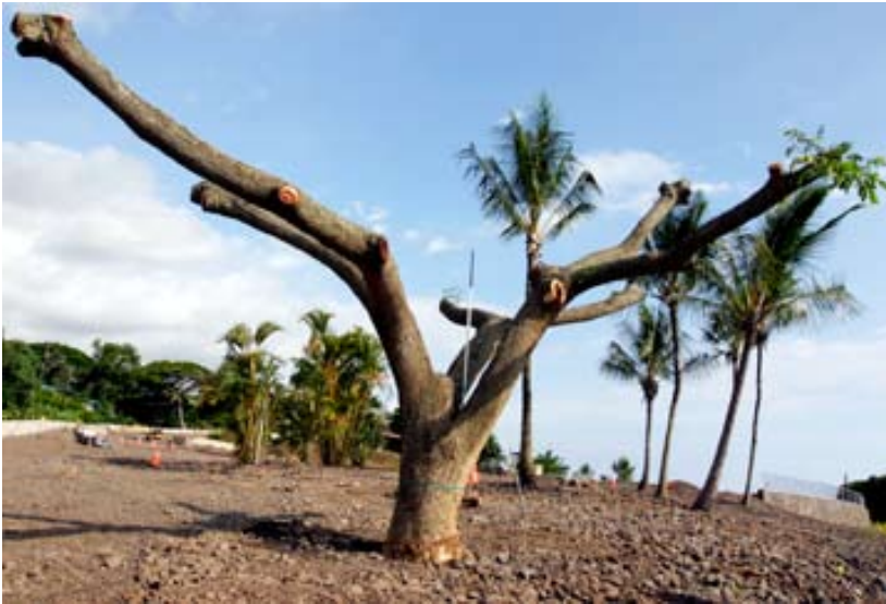
Large trees, as well as seedlings, can be transplanted readily by pruning the roots and branches, and ensuring sufficient irrigation for a few months.