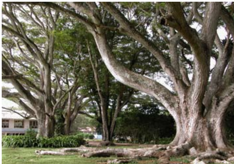
These large rain trees on the edge of a school playing field on Tongatapu island have canopies measuring over 60 m (200 ft) in diameter.

It is considered a fast-growing tree, although suboptimal conditions such as poor soil or restricted rooting area in urban areas often result in dwarfing effects on tree growth.