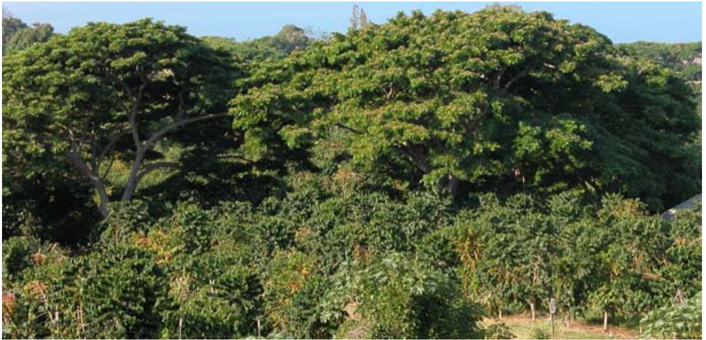
Rain tree has a characteristic dome-shaped canopy in open environments such as this coffee orchard.