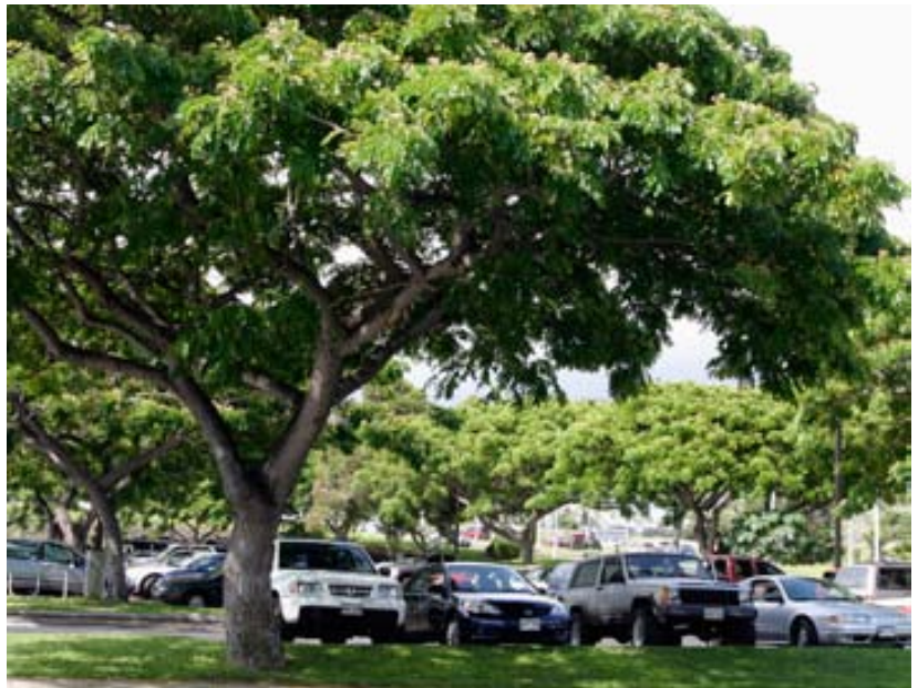
Rain tree is a common ornamental, particularly in public places.

Rain tree can be used in alley-cropping if heavily pruned, but it is rarely the most productive species choice for this purpose.