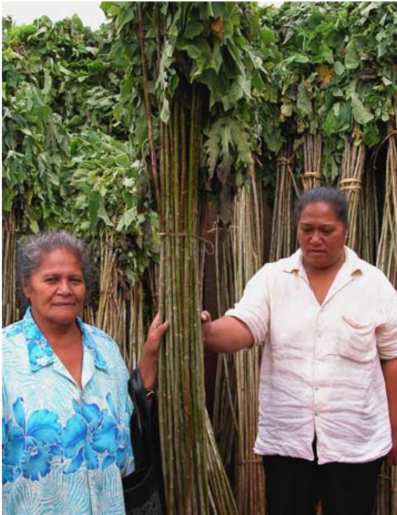
Paper mulberry stems are sold at the central market in Nuku'alofa, Tonga.