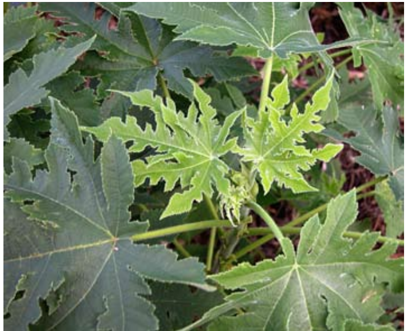
Paper mulberry leaves.

No varieties are reported. However, the ancient Polynesian plants are all male clones of the species, and it has been noted that Hawaiians used at least three terms to describe cultivars or forms of the plant (Meilleur et al. 1997).