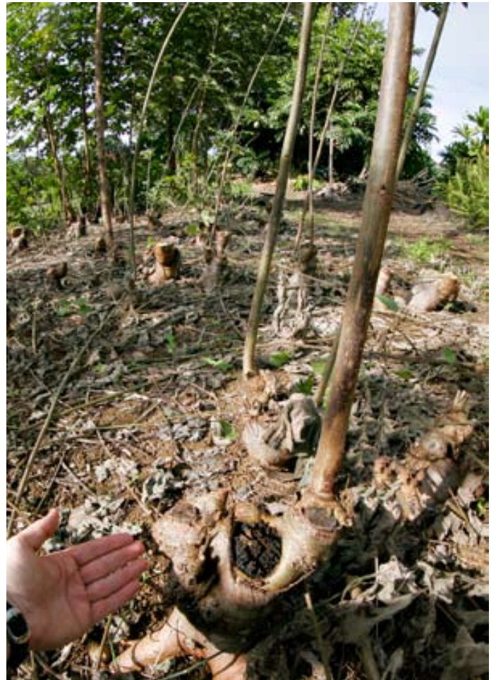
Left: Side branches should be removed when they are very small, as woody branches such as these will cause holes in the main stem bark. Right: Thinned stand of paper mulberry with side branches removed.

aouta [aute], in regular rows, at the distance of about 18 inches, or two feet..." In Fiji, Seemann (1865) noted the tree is "propagated by cuttings, and grown 60–90 cm (2–3 ft) apart, in plantations resembling nurseries. For the purposes of making cloth it is not allowed to become higher than about 4 m [13 ft] and about 4 cm [1.6 in] in diameter." In Hawai'i, plantations of paper mulberry were often surrounded by enclosures of dry banana leaves to protect the plants while they were young, and plantings of it were often surrounded by stone walls in the Marquesas.