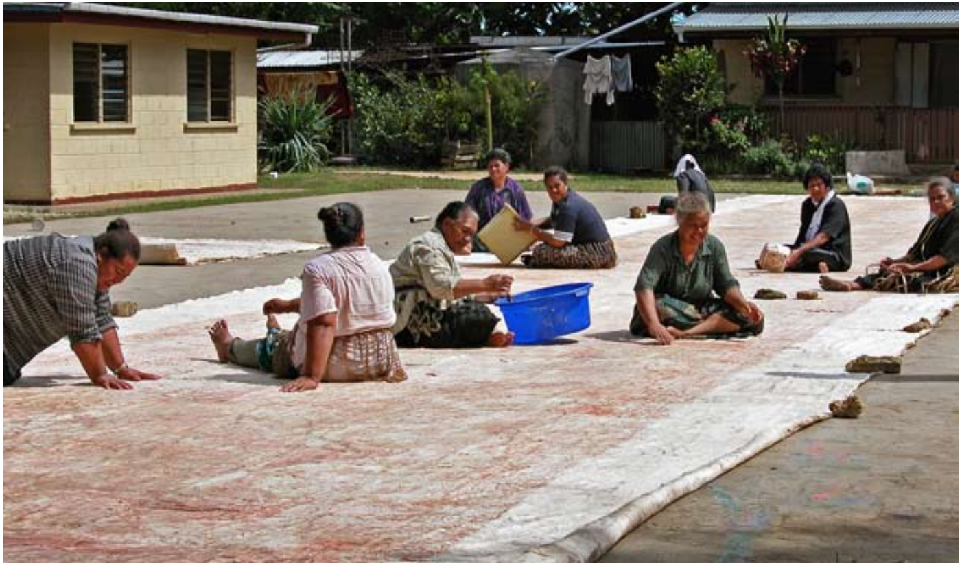
Tapa making remains a very important part of Tongan culture. Pieces of tapa are much valued as gifts to be given by Tongans on special occasions. Nuku'alofa, Tonga.