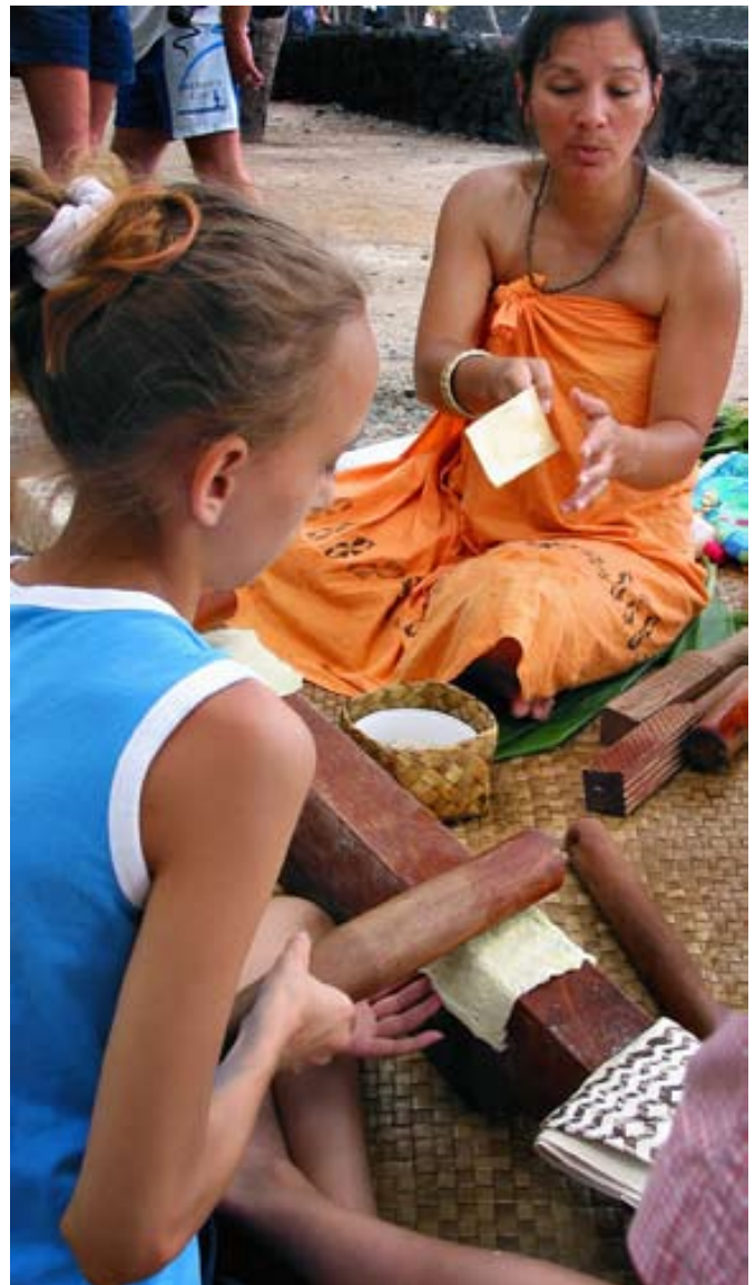
The traditional art of tapa making is being rediscovered in Hawai'i, as at this cultural demonstration at Pu'uhonua o Hōnaunau, Kona, Hawai'i.

nized on islands and archipelagoes where its bark is no longer fashioned into tapa cloth (i.e., in most of Polynesia except Tonga, Samoa, and Fiji). It is now recognized as a culturally significant plant in Hawai'i, however, which has led to a renewed interest in its cultivation. On the U.S. mainland, where both fertile male and female trees have been introduced, it is found from Illinois to Massachusetts, south to Florida and west to Texas. The tree is reportedly naturalized in Burma and Thailand.