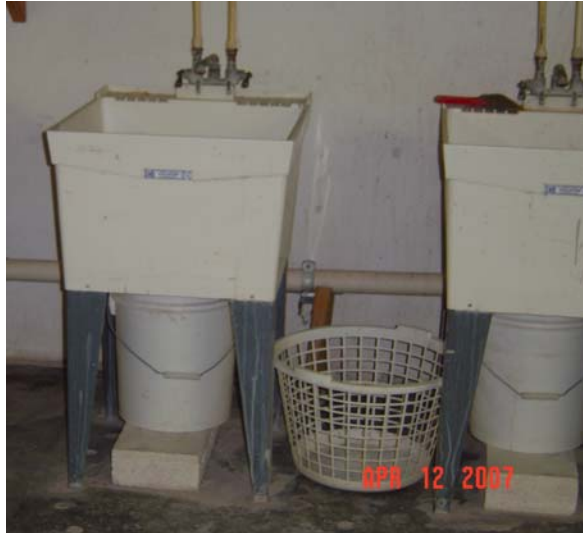
Figure 4. Sink

When adding water to the dry materials, workers must transport the bucket to a sink in a different area of the building. Workers either use a cart or carry the bucket to the sink and manually lift the bucket into the basin (see Figure 4). When the appropriate amount of water is added, they must remove the bucket from the basin to transport it to the mixer.