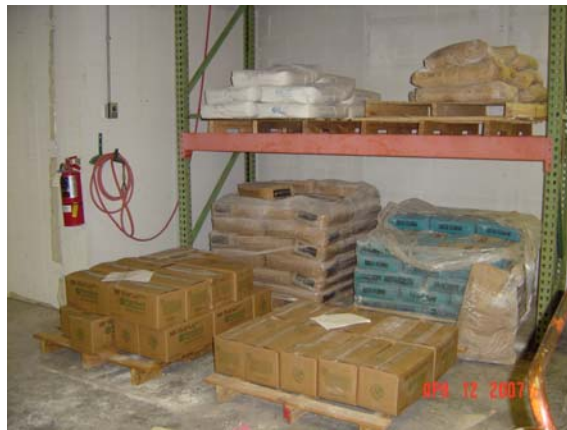
Figure 2. Bags and boxes of raw material

Bagged and boxed dry clay and glaze materials weighing 50 pounds are stored on pallets on and around shelves (see Figure 2). Lifting from pallets stored on the floor to the shelves requires bending, resulting in the vertical location of the hands ranging from 4" to 32". Accessing materials stored on the shelf requires reaching and lifting above shoulder height. Workers informed us that they occasionally use a forklift truck to pull the pallet off the shelf and position it to a more appropriate height instead of lifting overhead. The pallets on the floor are not height adjustable, and in most cases, workers cannot access them from all sides.