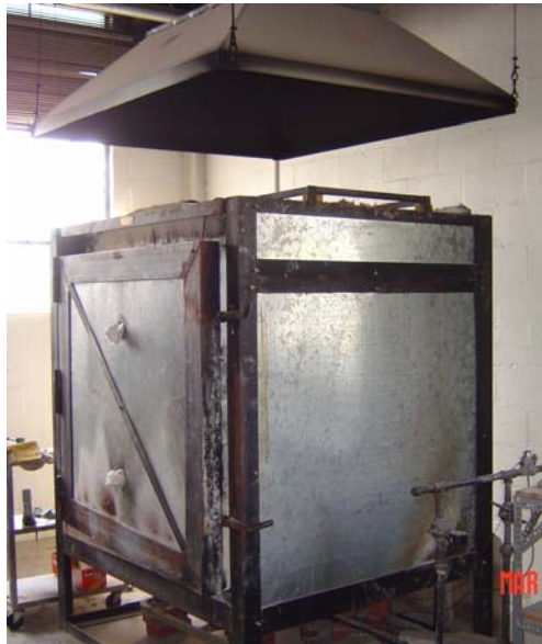
Figure 1. Reduction kiln with hood

Air sampling was performed for VOCs, NO 2 , SO 2 , CO 2 , and CO during the firing of the reduction and electric kilns. Five area samples were taken for VOCs throughout the shop in various work areas. Only trace amounts of contaminants (perchloroethylene, trichloroethylene, benzene, and C 5 -C 7 aliphatic hydrocarbons) were detected in any of the samples. Air samples collected using Draeger colorimetric detector tubes at various times during the kiln-firing process throughout the facility showed that NO 2 and SO 2 were not detectable above the LOD (0.5 ppm).