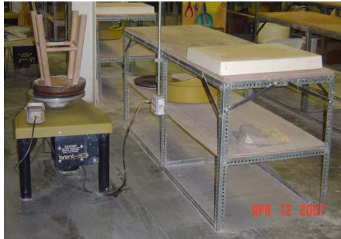
Figure 6. A typical potter's workstation

walk-through tour had an approximately 1" difference between the throwing surface and seat, which may cause back discomfort. As a result of back discomfort, one potter had asked that a workstation be modified for working while standing (see Figure 7).