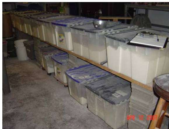
Figure 3. Plastic tote storage

The dry clay and glaze materials are prepared for use in large plastic totes (see Figure 3). Due to lack of storage space, half of the boxes are positioned on a raised platform (vertical location = 36" to handle) and the other half are positioned under the platform on dollies (vertical location = 15" to handle).