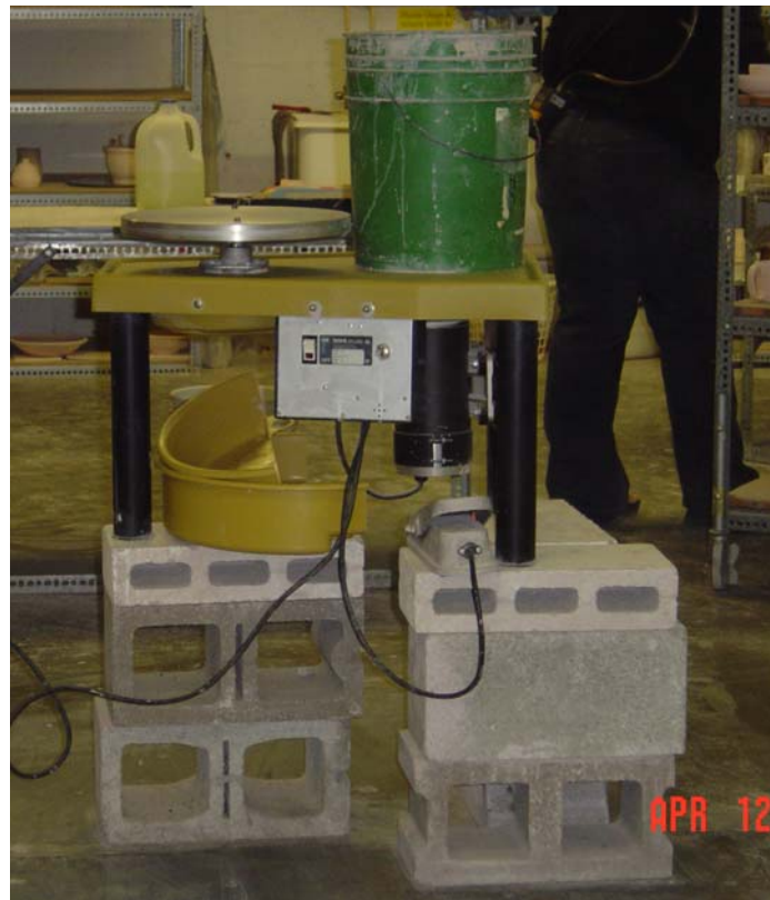
Figure 7. A modified potter's workstation