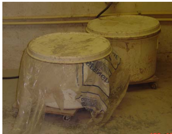
Figure 5. Buckets used in mixing/pugging room

In the mixing/pugging room, the machines are raised on platforms to bring them to a more appropriate level. However, the buckets (see Figure 5) and carts used to transport the material in this area are too low and are not adjustable.