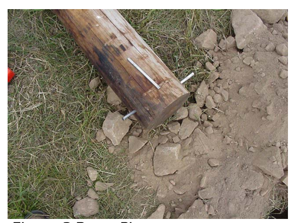
Figure 2 Brace Pins What's the best way to finish off the burying process?

wet cement is is often used research has found that wetting a ready mix cement product is only slightly better than putting in a dry product and letting the natural moisture in the soil hydrate until it sets up.