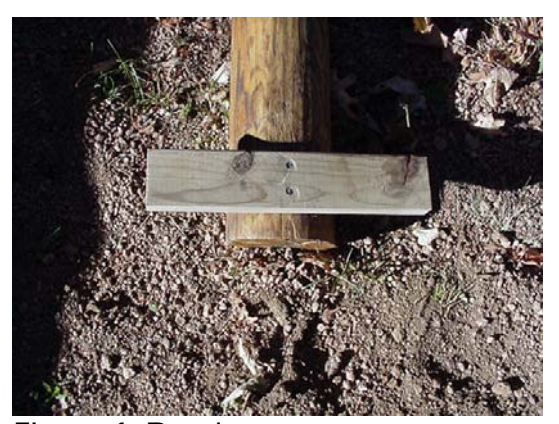
Figure 1. Deadman post support

Unfortunately it isn't always possible to get posts in as far needed to keep it from being pulled up. Even when you use backfill material that is easier to set up around a post and less likely to heave, there are a few methods that are commonly used to help anchor a post in the ground. One of the simplest methods is simply attaching something to the bottom of the post before putting it in the ground. One method is to nail a piece of wood to the bottom of the post. This device is often called a deadman and is shown in Figure 1.