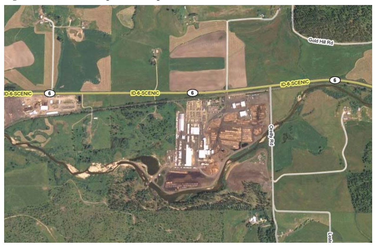
Figure A-1: Location map and aerial photo