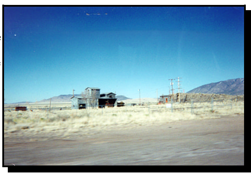
PHOTO #2 - Groundwater sampling by EPA and the Corps of Engineers in August 1998 was conducted to evaluate the effectiveness of the remedy. Groundwater contaminated with cyanide is being extracted from a string of 6 groundwater recovery wells and conveyed to a publically owned treatment works (POTW) facility.

PHOTO #1 - Abandoned buildings of the Cimarron Mining Superfund site are enclosed by a 6 foot chain-link fence. The site processed precious metal containing ores using conventional methods. Several piles of ore remain on the site (right side of picture)